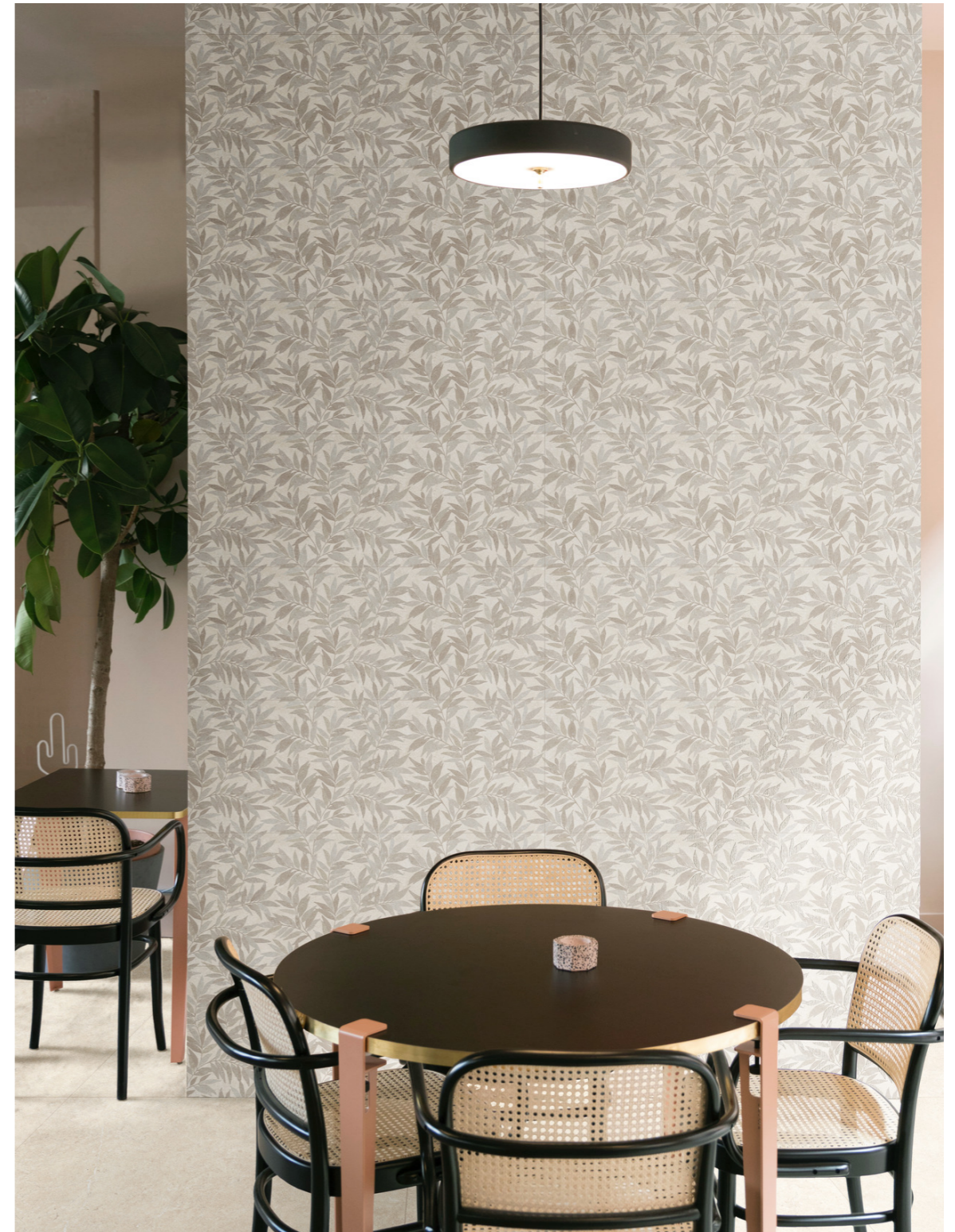
MFCP Limestone Wall Decoro Agrifoglio Ivory Touch Rt 40x120cm M907 Limestone Ivory Rt 120x120cm