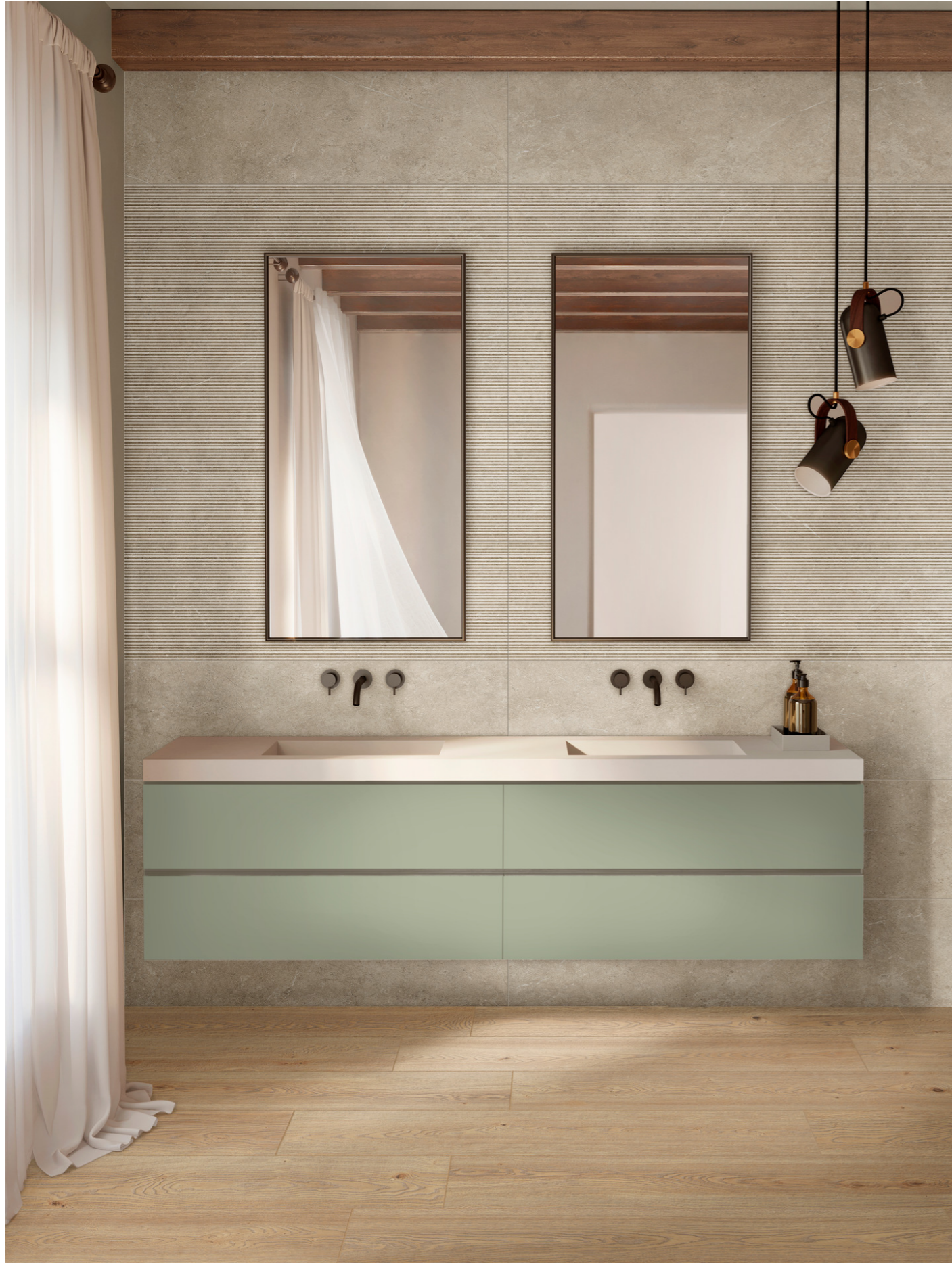
MFDD Alma Beige Rt 20x120cm MFCK Limestone Wall Taupe 3D Mikado Rt 40x120cm MFCF Limestone Wall Taupe Rt 40x120cm