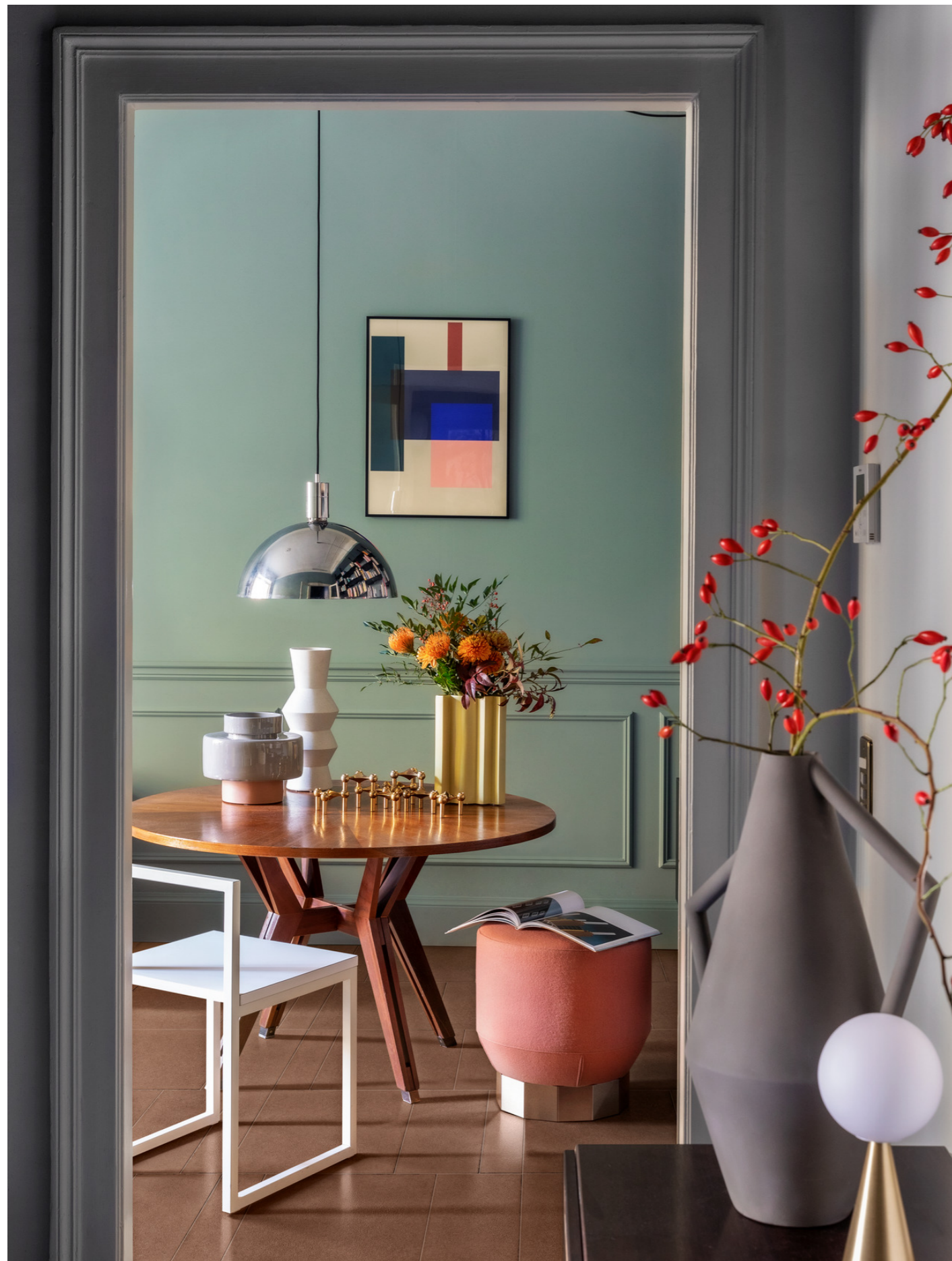
MPLY Terramater Cotto Lux 37x37cm MPLS Terramater Cotto Lux 18x37cm MPLL Terramater Cotto Lux 9x37cm