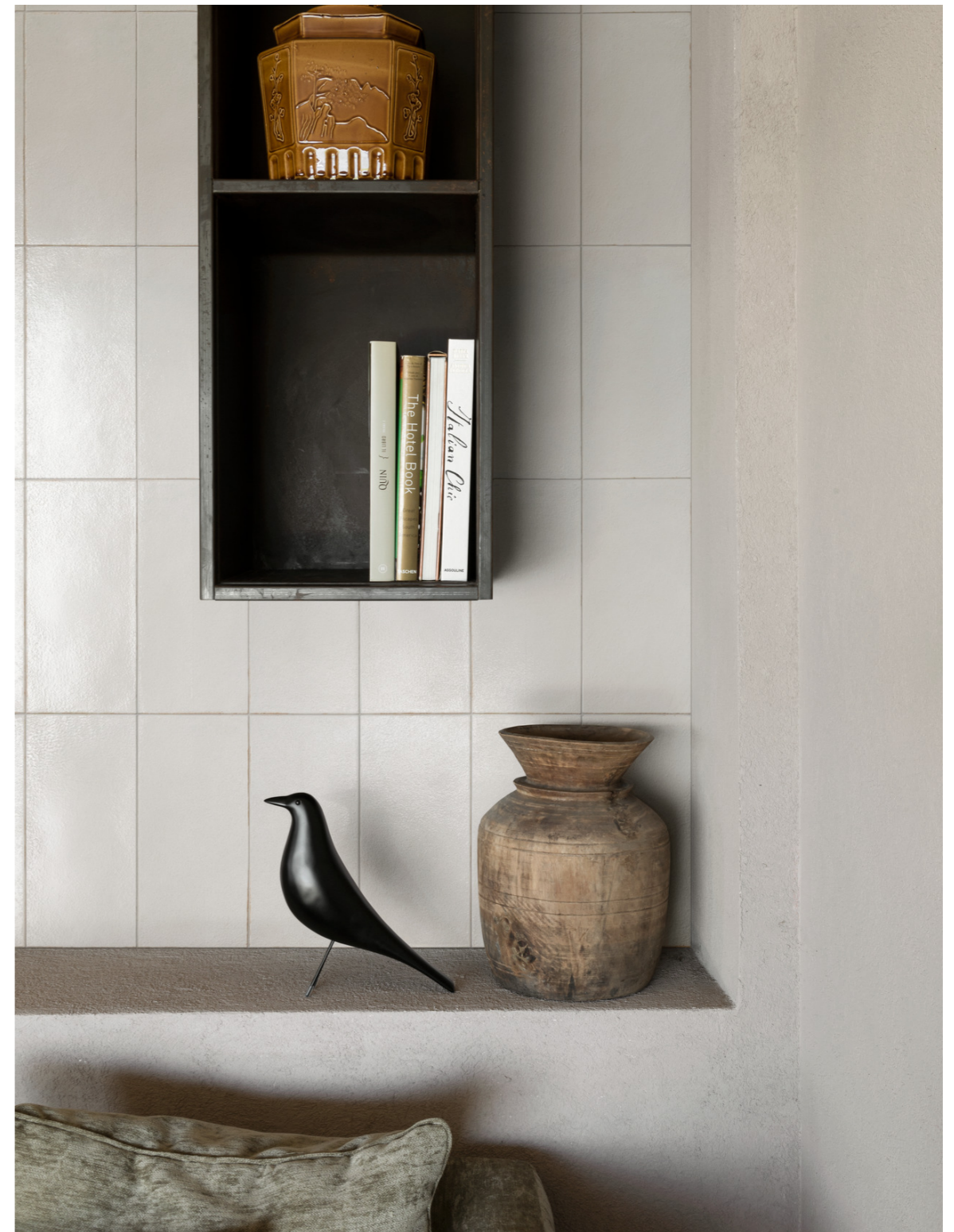
MPLQ Terramater Vaniglia Lux 18x37cm