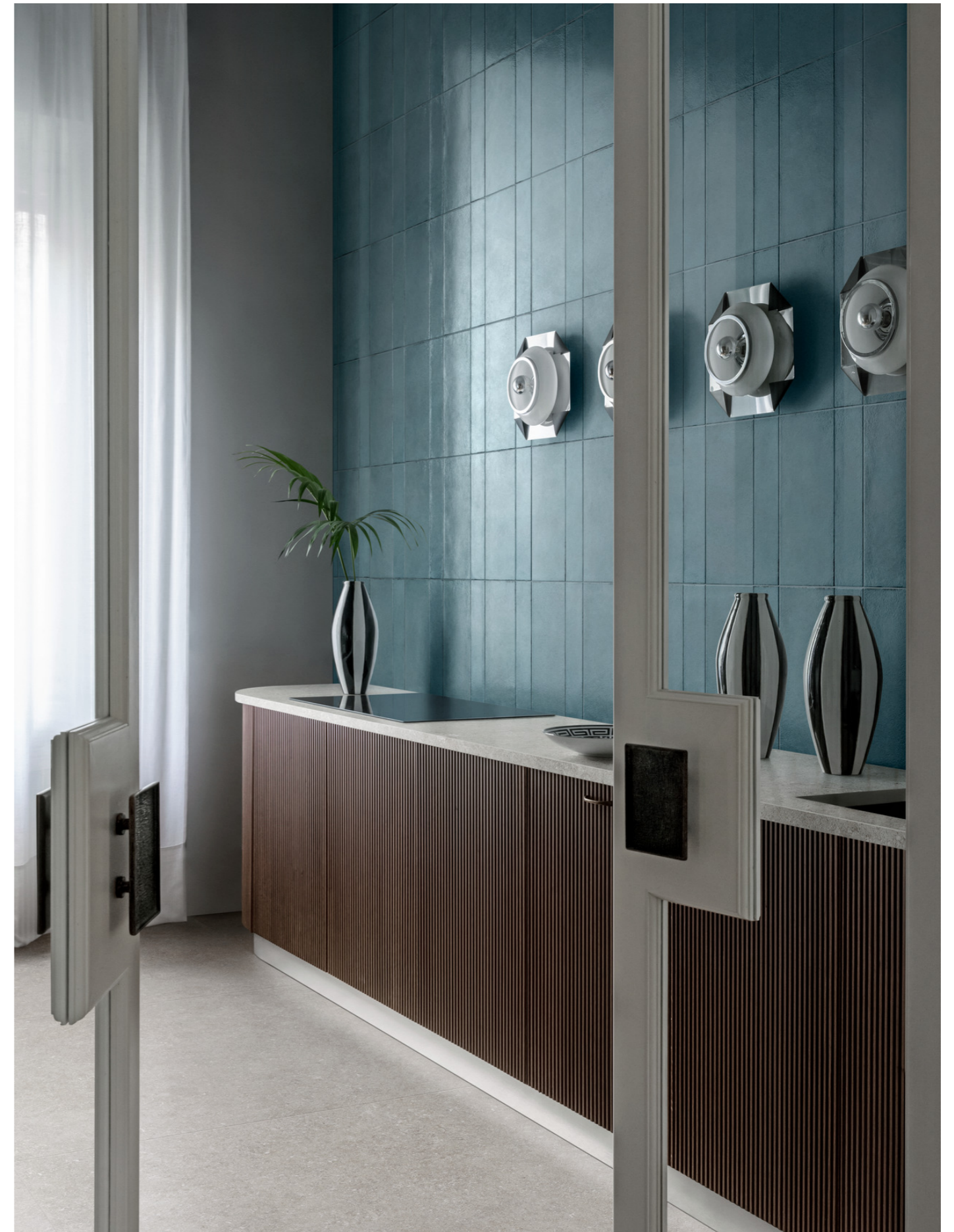
MPLU Terramater Laguna Lux 18x37cm MPLN Terramater Laguna Lux 9x37cm MJZR Grande Stone Look Berici Grigio Naturale 3D Ink Rt 120x278cm MGOY Mystone Berici Grigio Rt 120x120cm