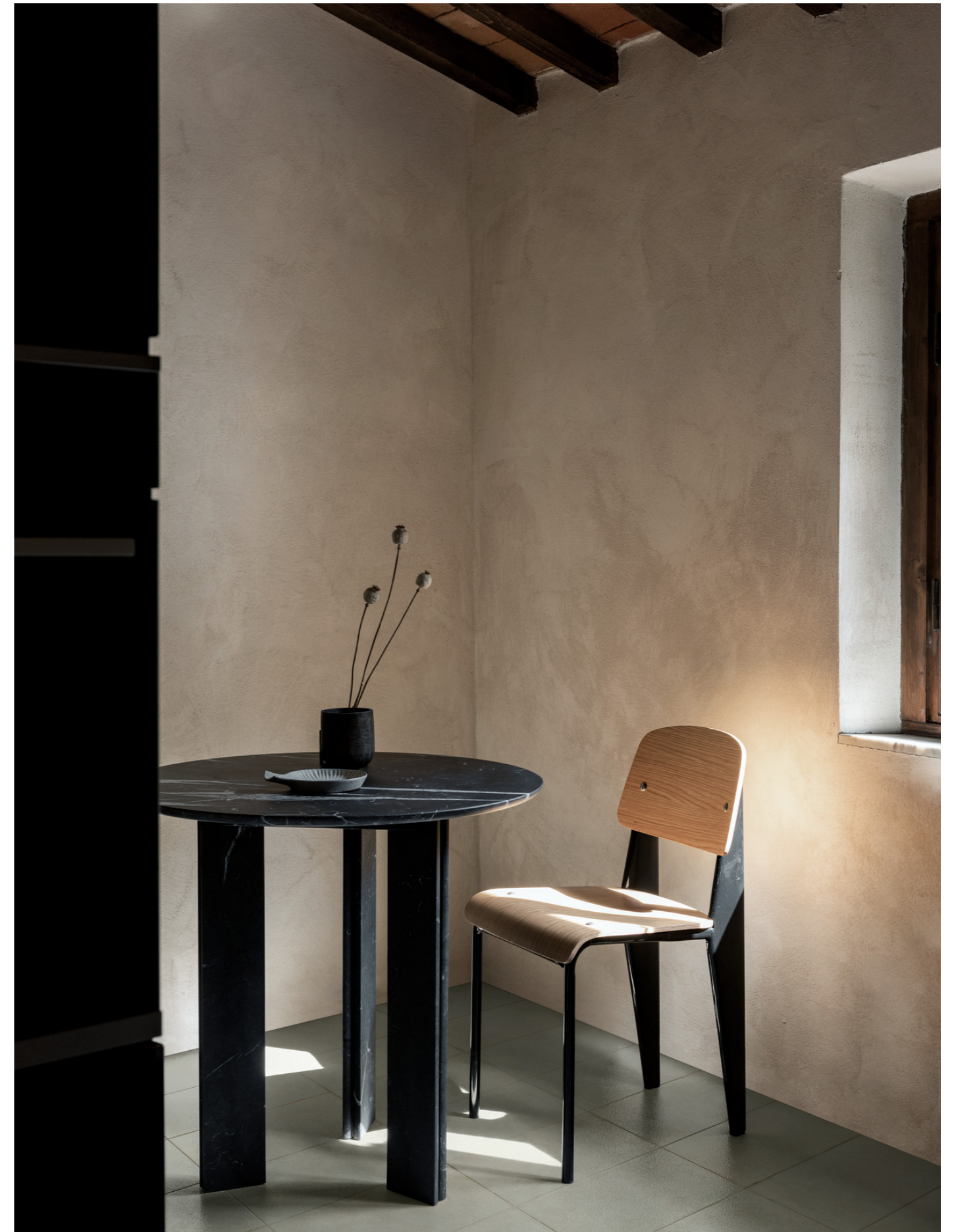
MPLR Terramater Dune Lux 18x37cm