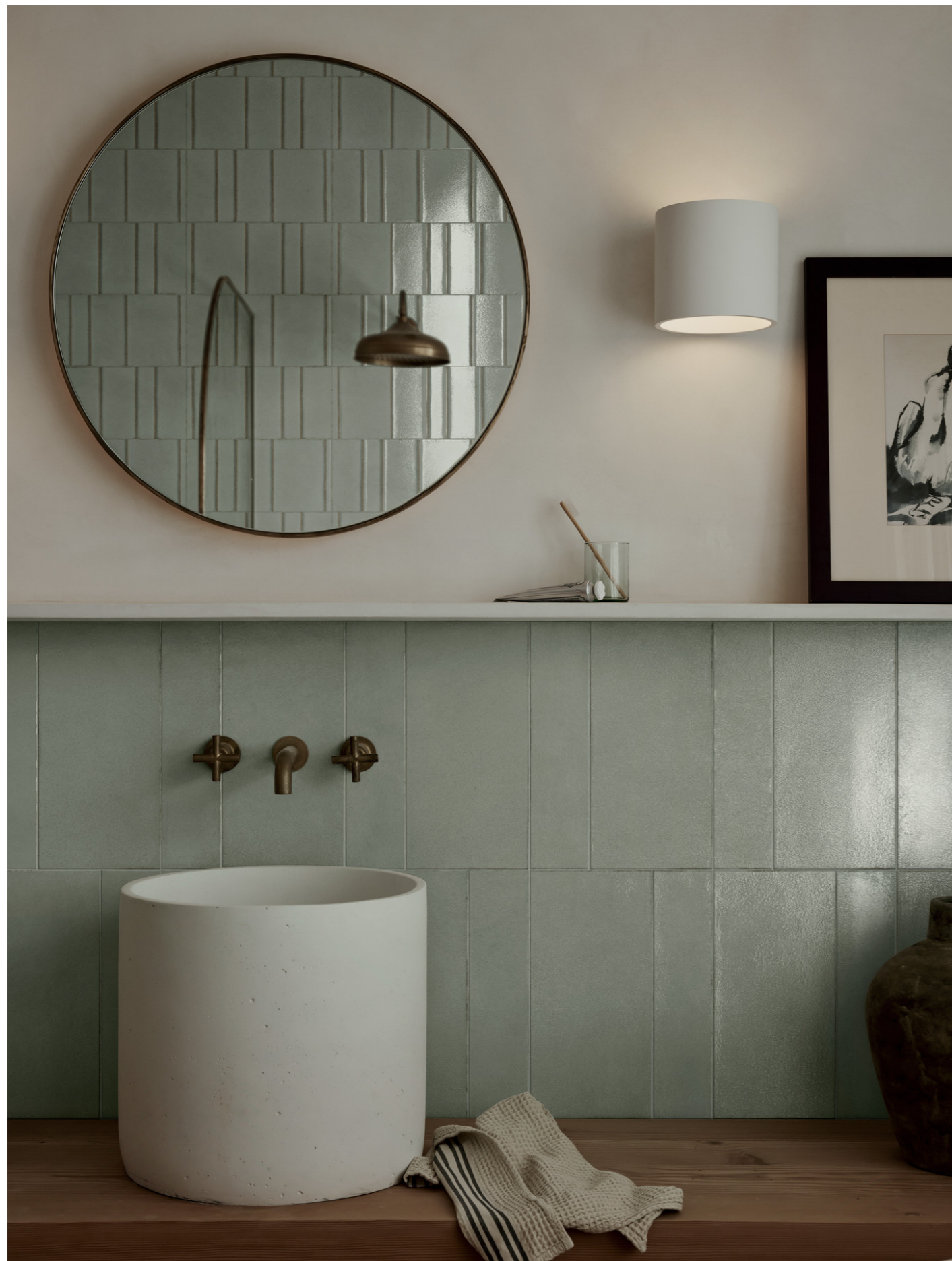
MPM9 Terramater Lichene Struttura 3D Ritmo Lux 18x37cm MPLV Terramater Lichene Lux 18x37cm MPLP Terramater Lichene Lux 9x37cm