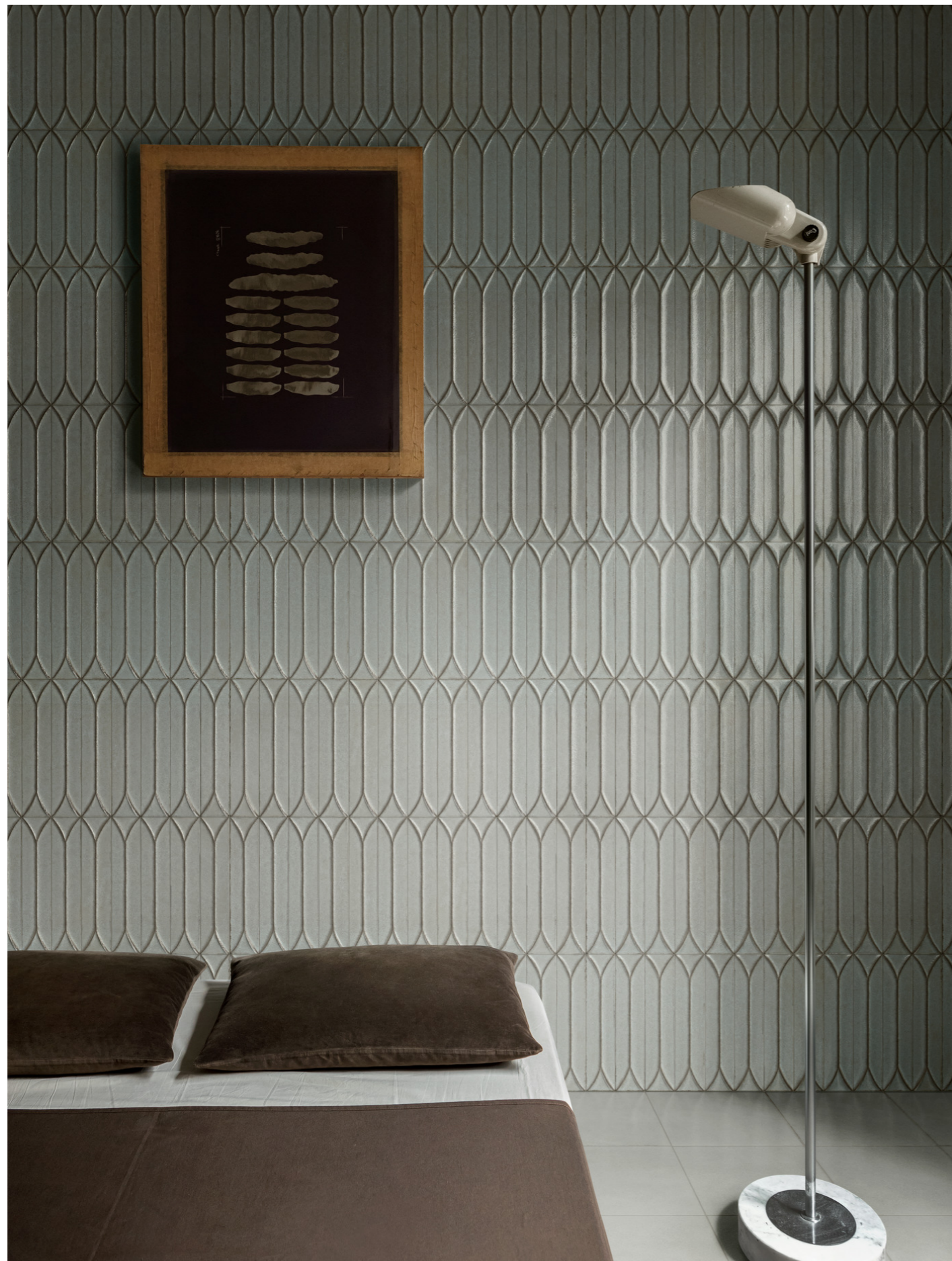
MPM3 Terramater Lichene Struttura 3D Losanga Lux 9x37cm MPLW Terramater Lichene Lux 37x37cm