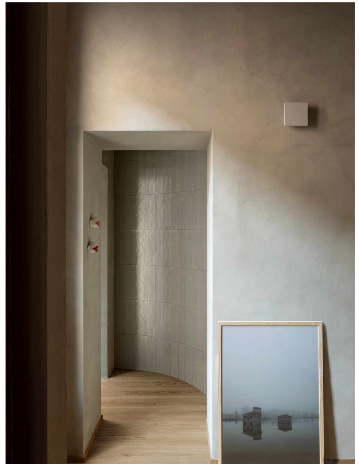
MPLK Terramater Muschio Lux 9x37cm M9EA Oltre Natural Rt 20x120cm