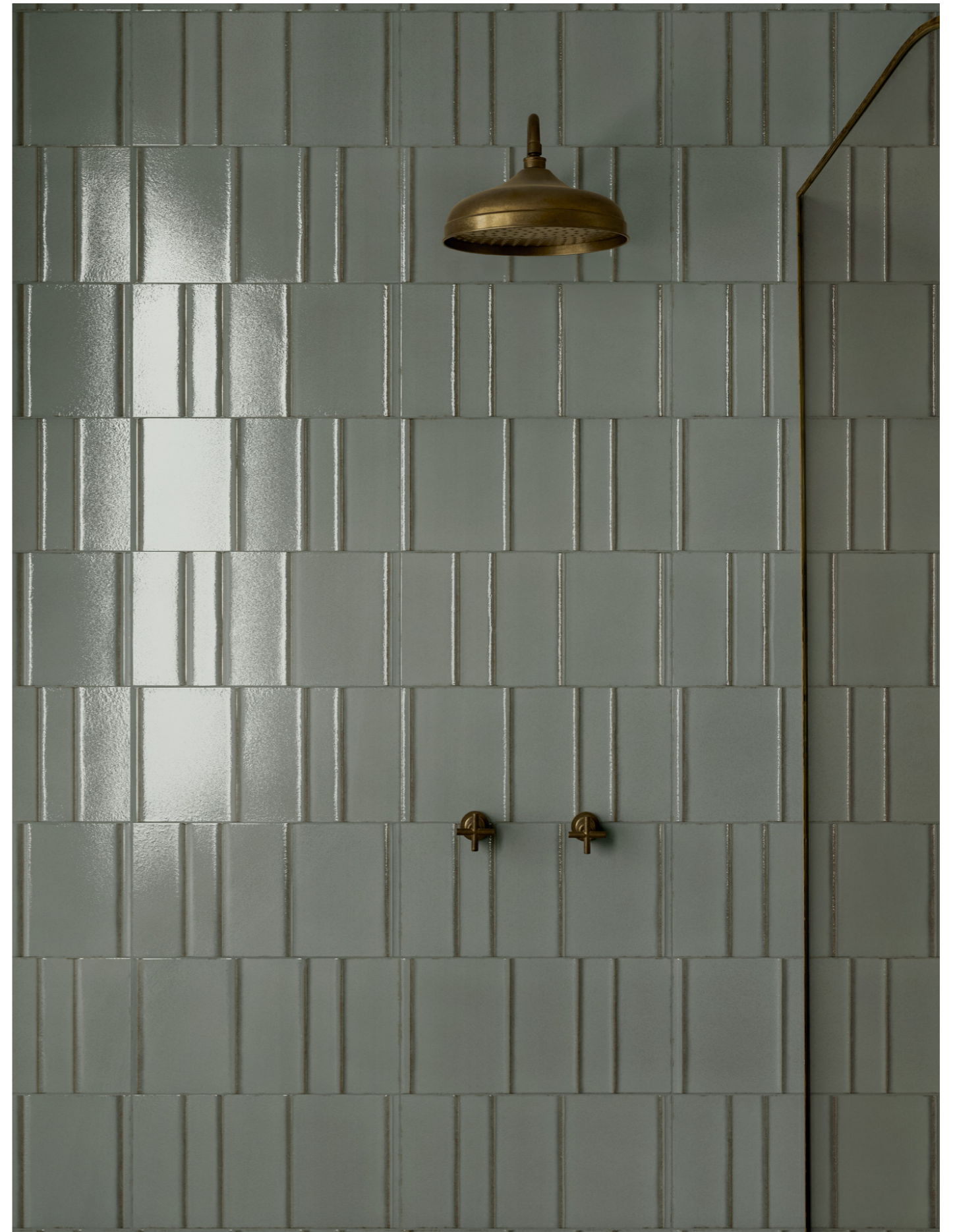
MPM9 Terramater Lichene Struttura 3D Ritmo Lux 18x37cm