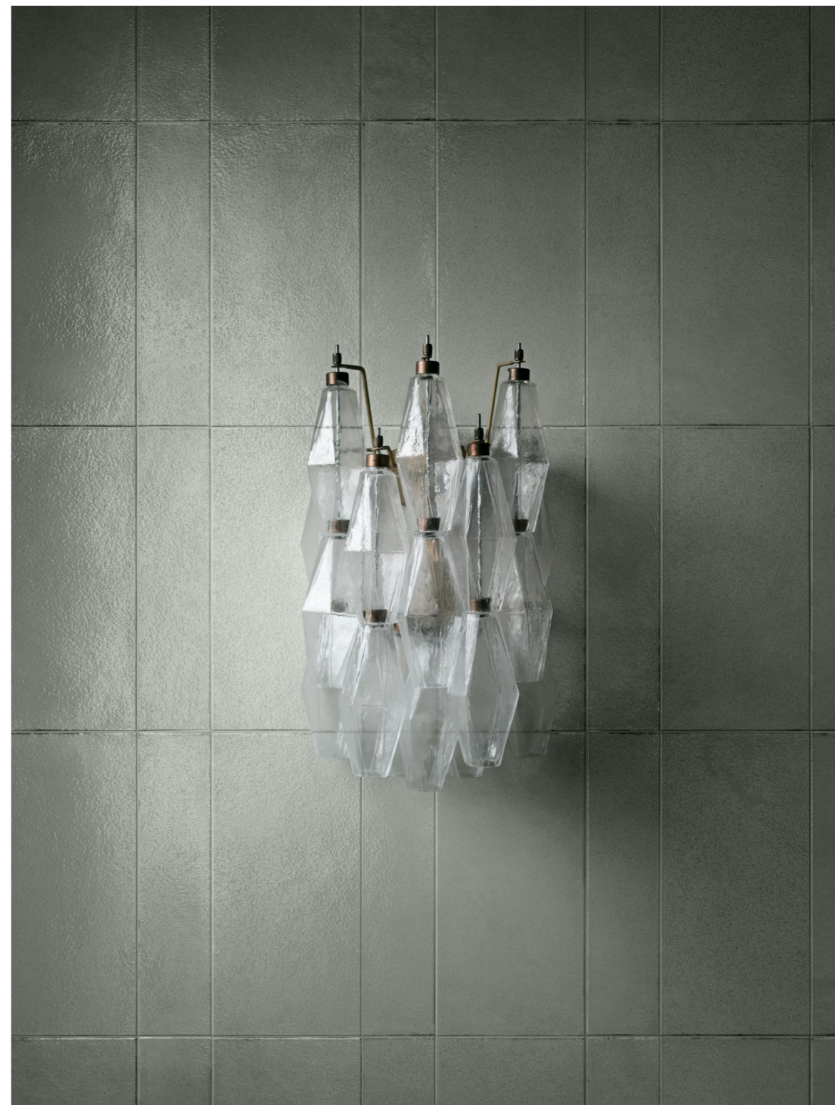
MPLV Terramater Lichene Lux 18x37cm MPLP Terramater Lichene Lux 9x37cm