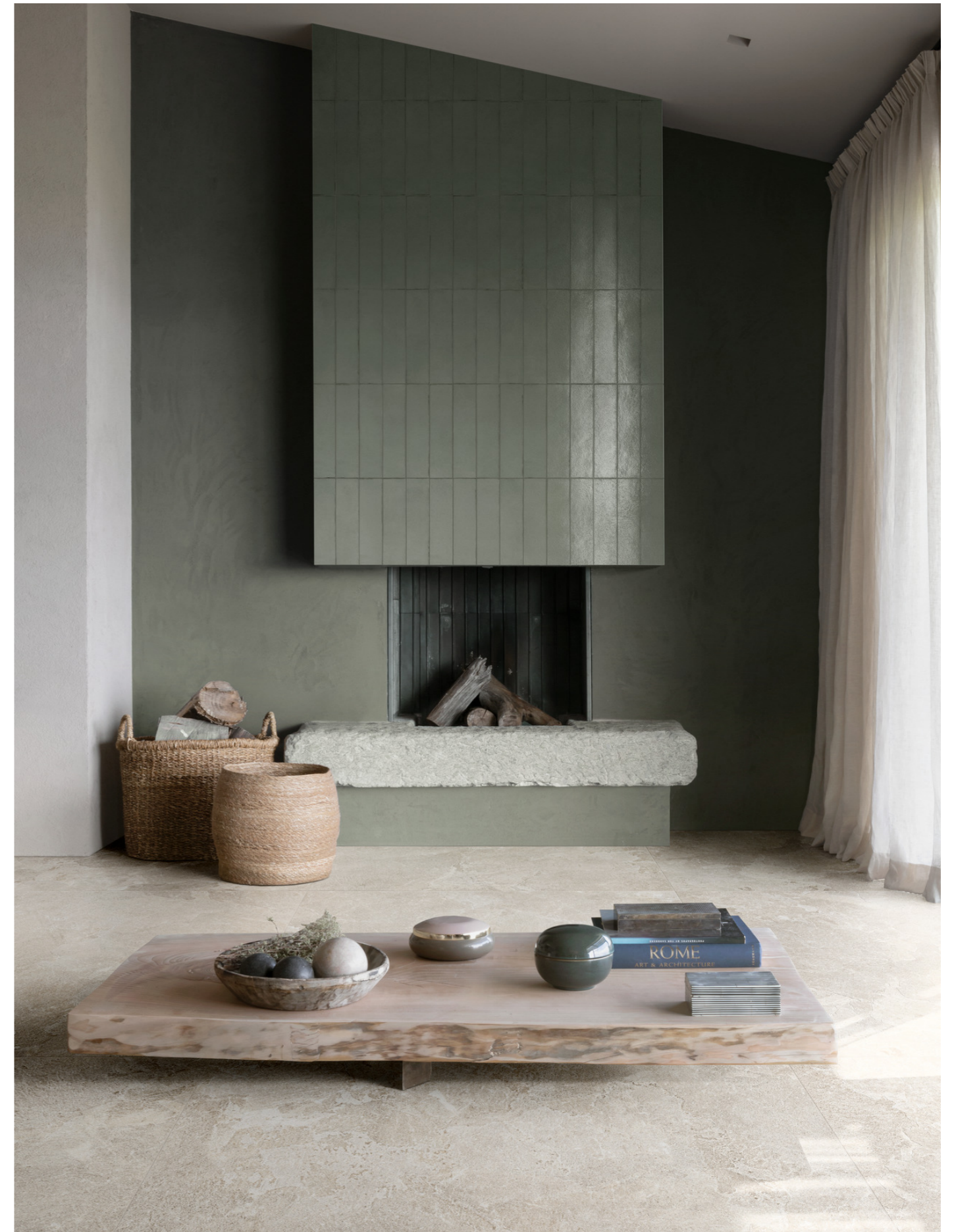
MPLP Terramater Lichene Lux 9x37cm MPJK Mystone Pietra Ligure Bianco Rt 120x120cm