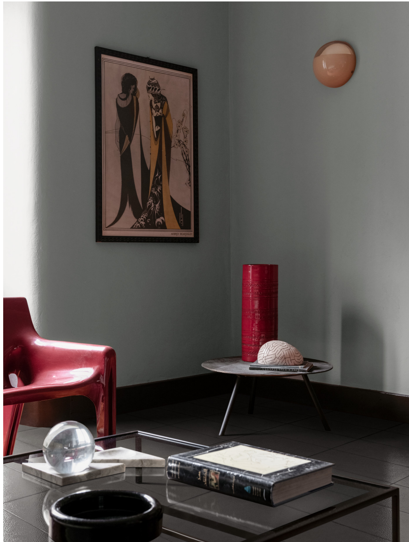
MPS2 Terramater Carbone Lux 18x37cm