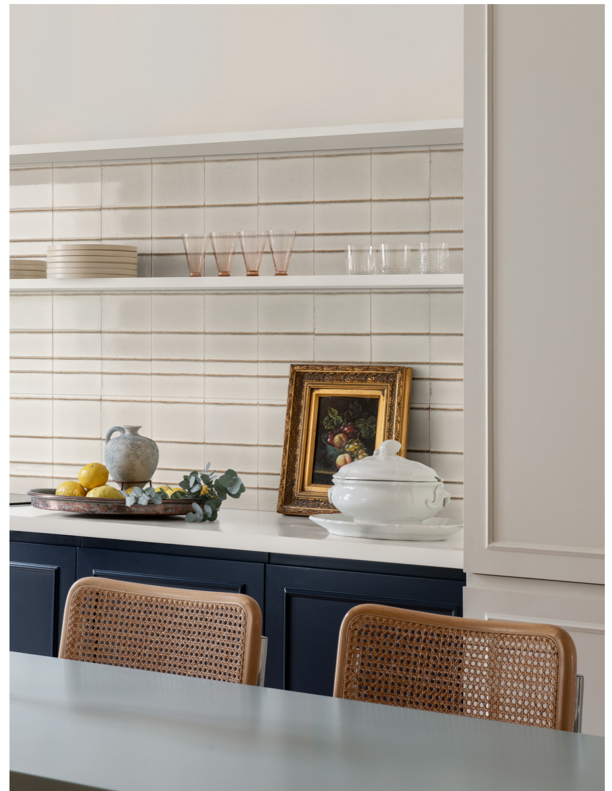
MPM8 Terramater Vaniglia Struttura 3D Ritmo Lux 18x37cm