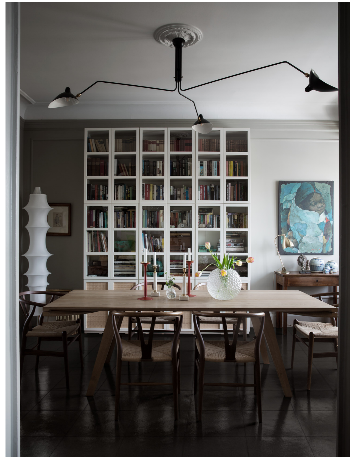
MPMH Terramater Carbone Lux 37x37cm