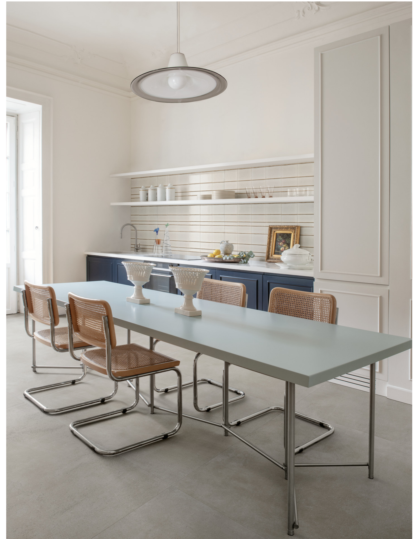
MPM8 Terramater Vaniglia Struttura 3D Ritmo Lux 18x37cm MPCS Slow Cold Nebbia Rt 120x120cm