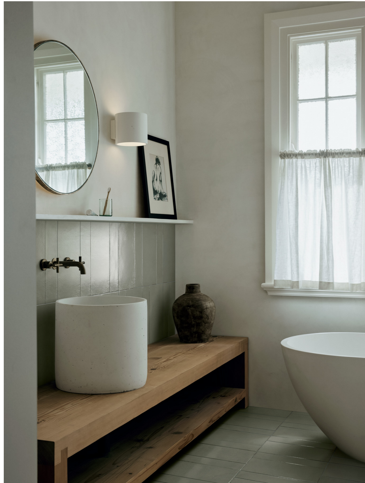
MPLV Terramater Lichene Lux 18x37cm MPLP Terramater Lichene Lux 9x37cm