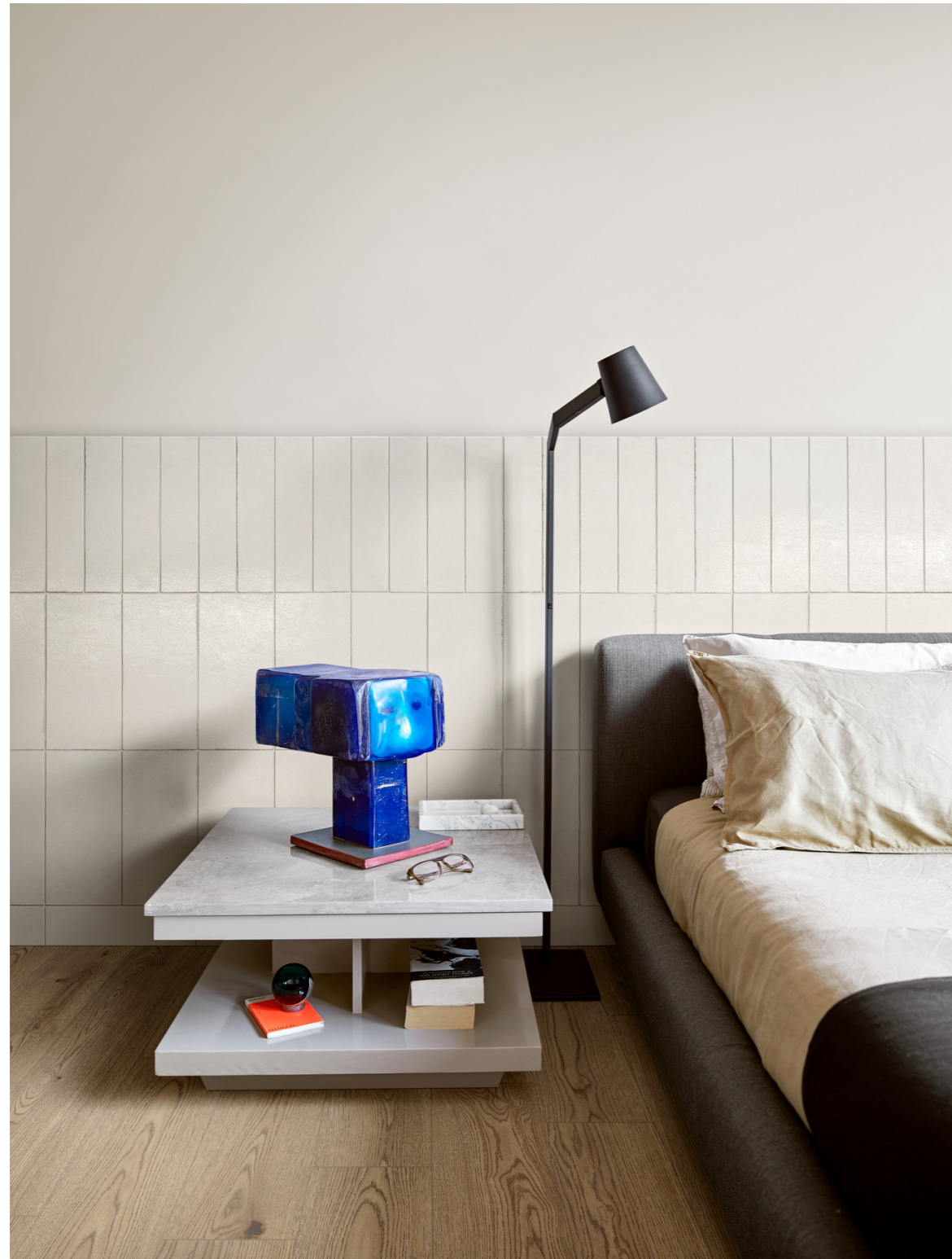
MPLQ Terramater Vaniglia Lux 18x37cm MPLM Terramater Vaniglia Lux 9x37cm MMDA Vivo Grano Rt 20x120cm