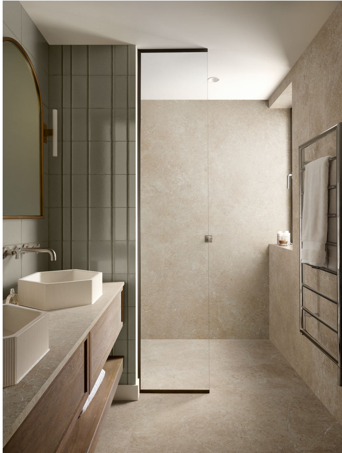
MPMC Terramater Muschio Struttura 3D Ritmo Lux 18x37cm MPLT Terramater Muschio Lux 18x37cm MAGN Grande Stone Look Limestone Sand Satin Rt 6Mm 160x320cm