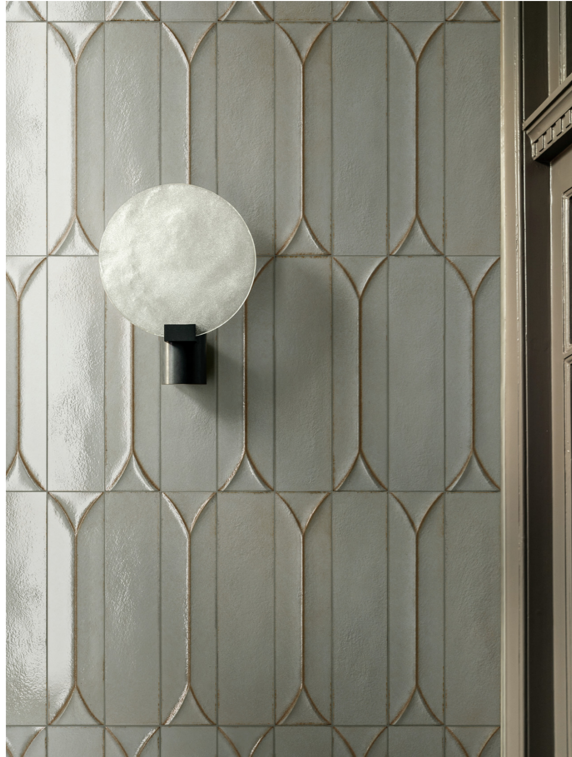
MPM6 Terramater Dune Struttura 3D Losanga Lux 9x37cm MPLJ Terramater Dune Lux 9x37cm