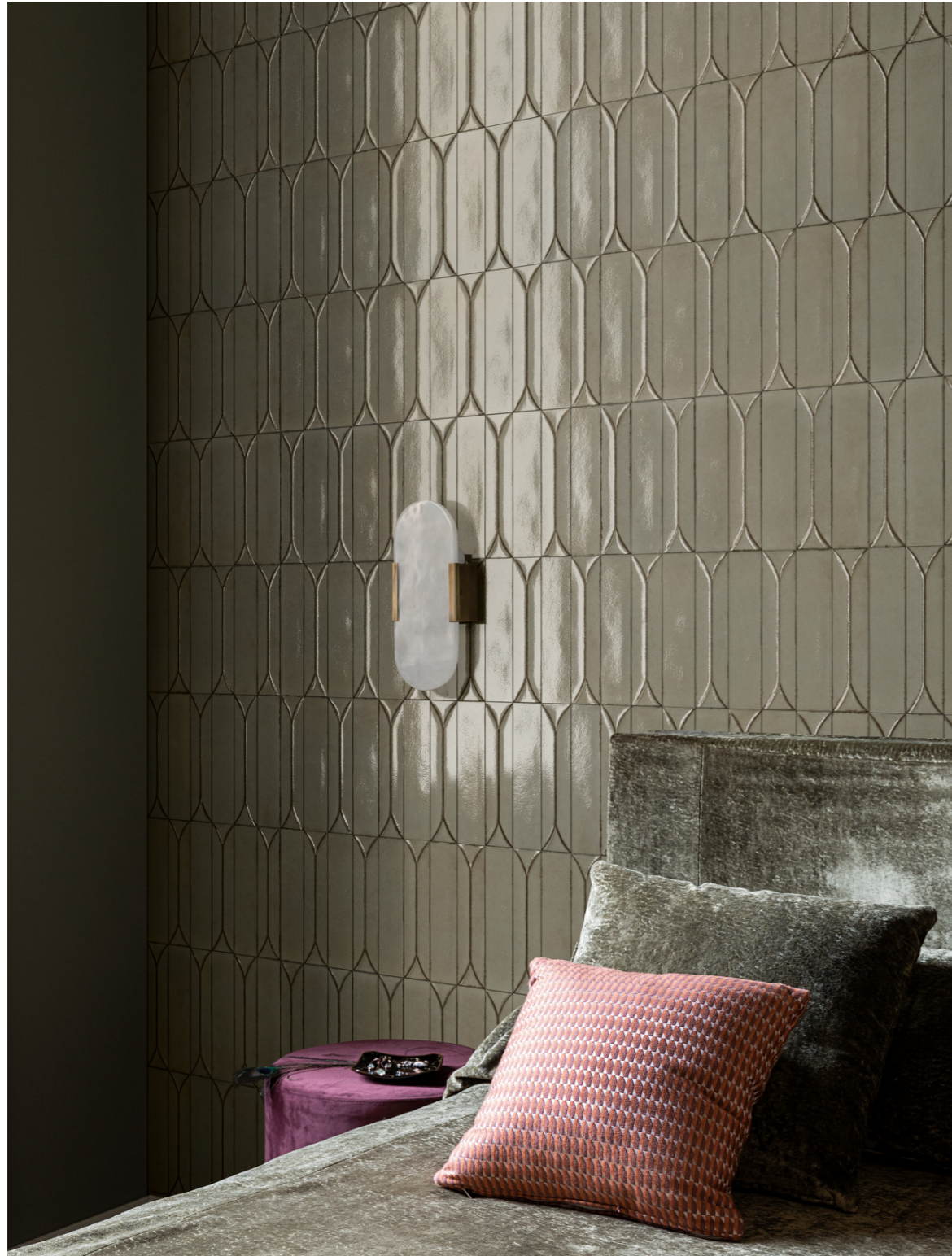
MPM4 Terramater Muschio Struttura 3D Losanga Lux 9x37cm MPLK Terramater Muschio Lux 9x37cm