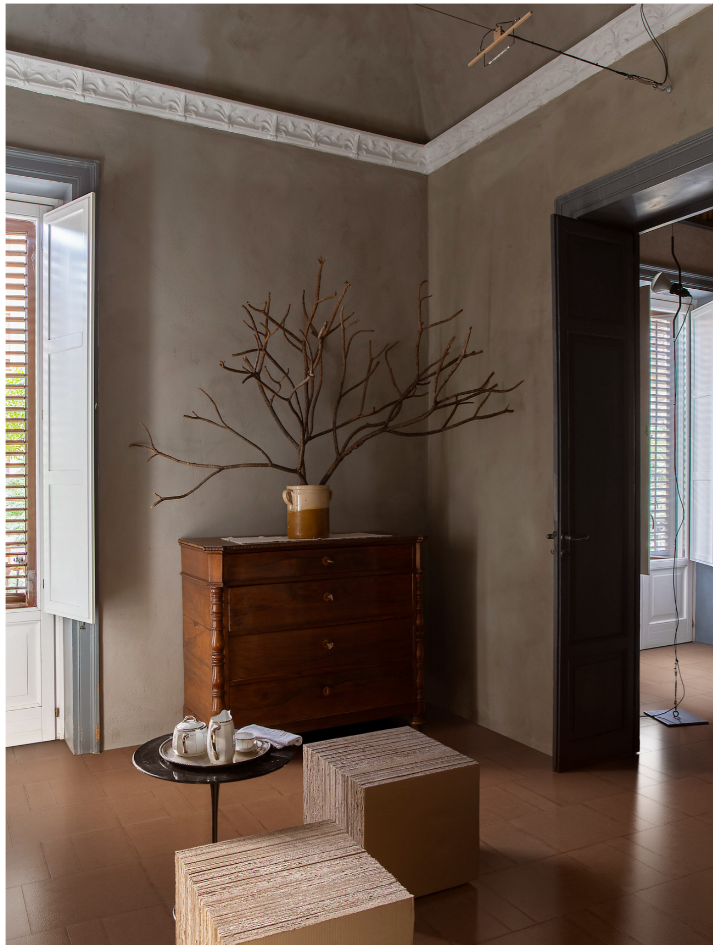
MPLY Terramater Cotto Lux 37x37cm MPLS Terramater Cotto Lux 18x37cm MPLL Terramater Cotto Lux 9x37cm