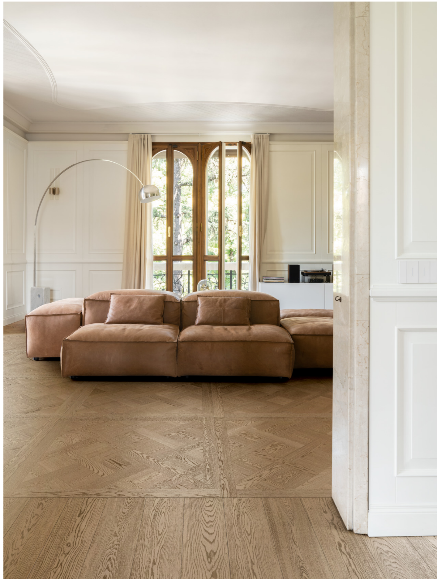
MF7F Intrecci Nocciola Rt 20x120cm MEK5 Intrecci Versailles Nocciola Rt 120x120cm