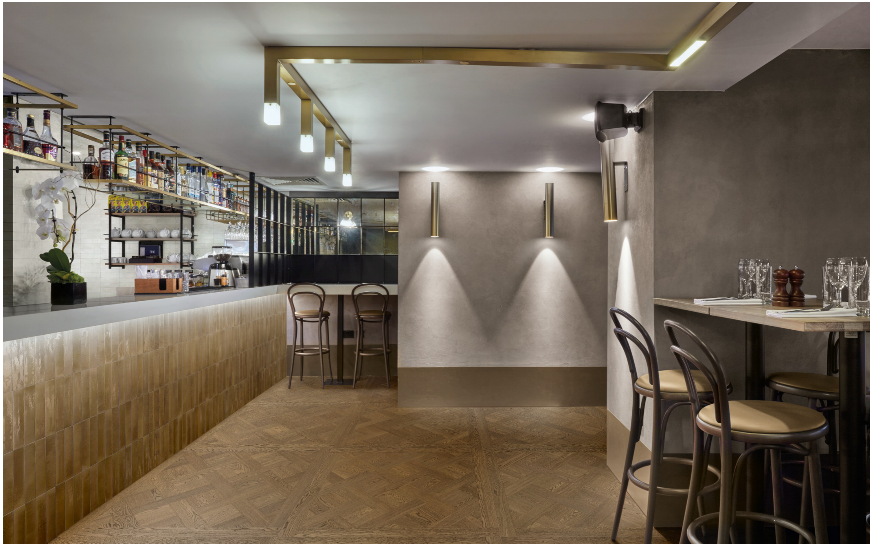
MA9P Lume Off White Lux 6x24cm MA9K Lume Beige Lux 6x24cm