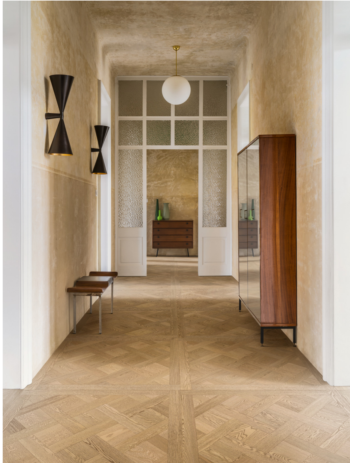
MEK5 Intrecci Versailles Nocciola Rt 120x120cm