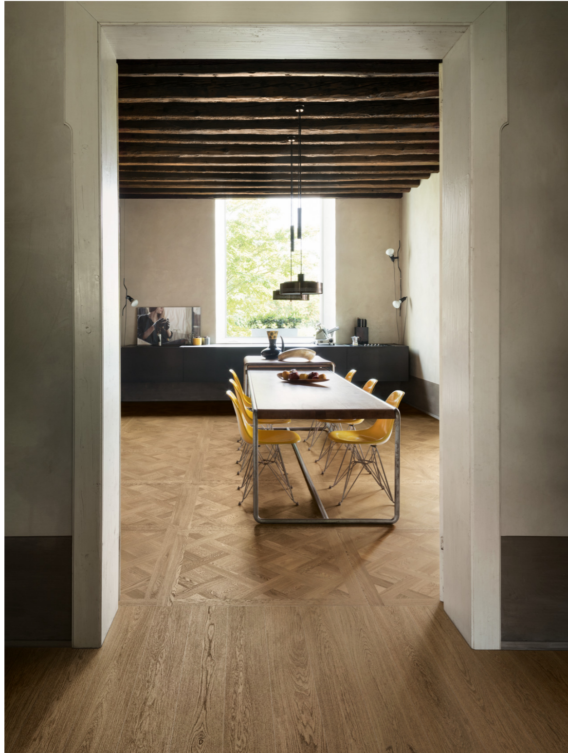
MF7G Intrecci Castagna Rt 20x120cm MEK4 Intrecci Versailles Castagna Rt 120x120cm