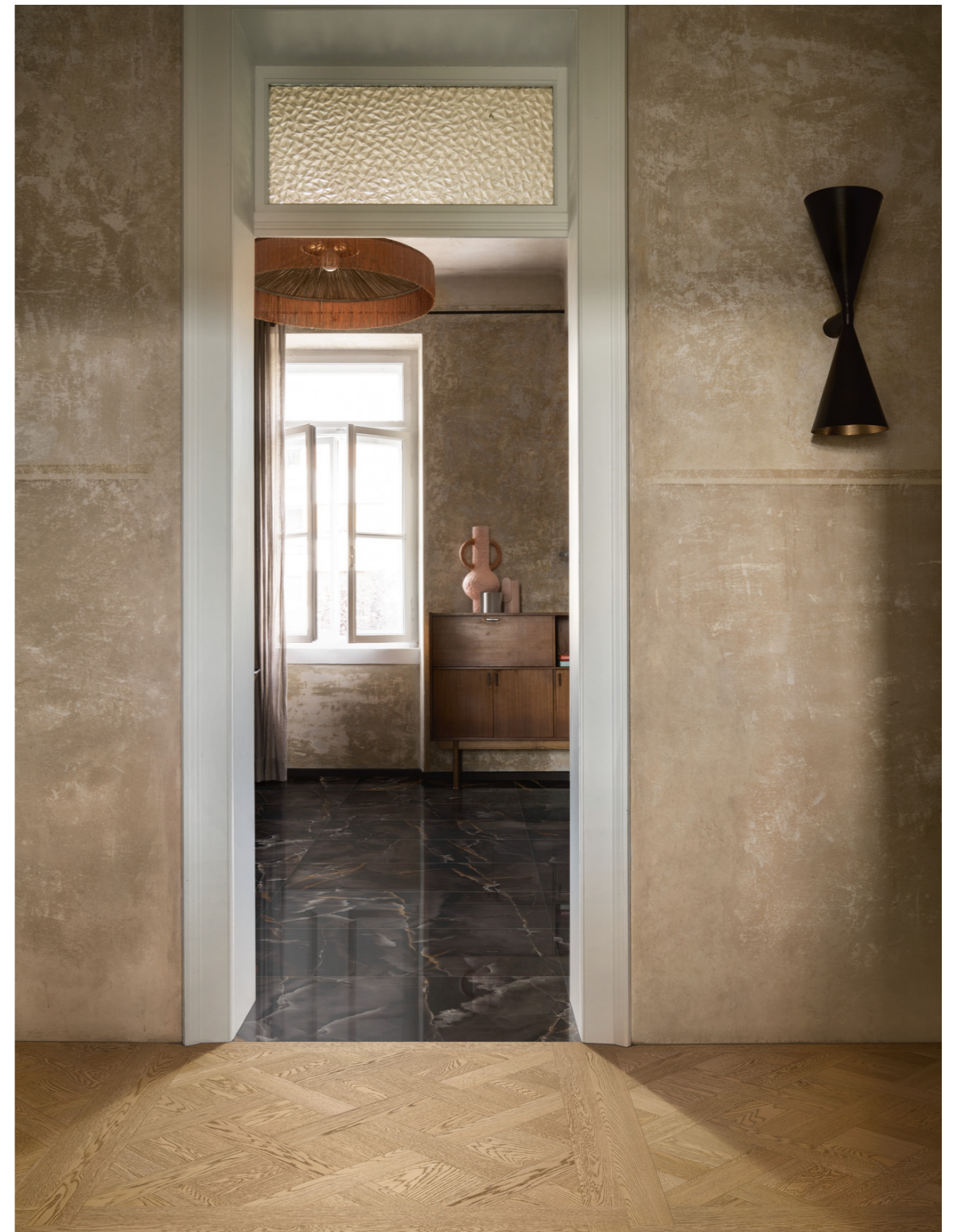
MEX7 Grande Marble Look Onice Nero Lux Rt 60x120cm MEK5 Intrecci Versailles Nocciola Rt 120x120cm