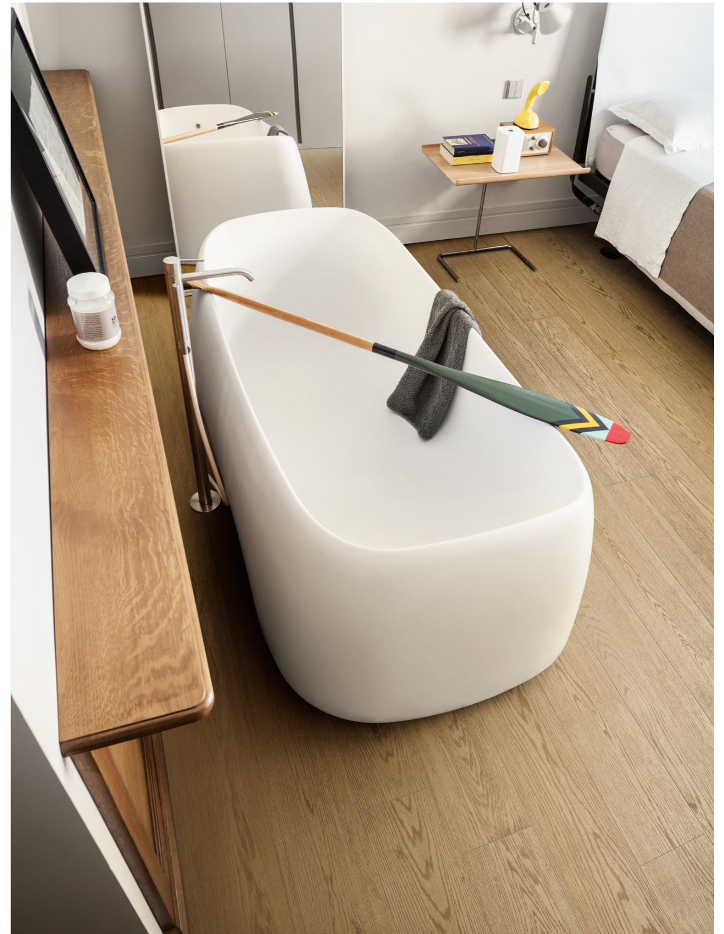
MF7D Intrecci Miele Rt 20x120cm