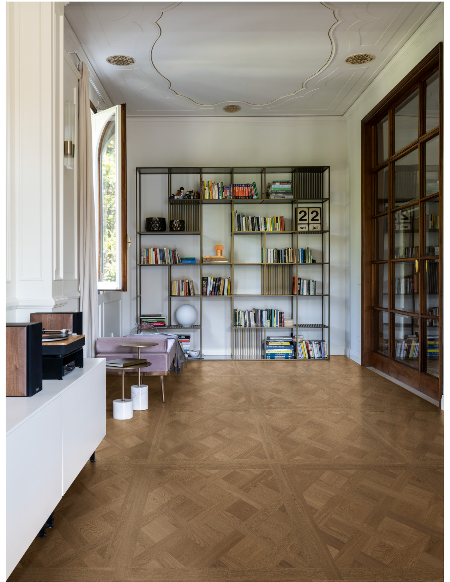
MEK4 Intrecci Versailles Castagna Rt 120x120cm