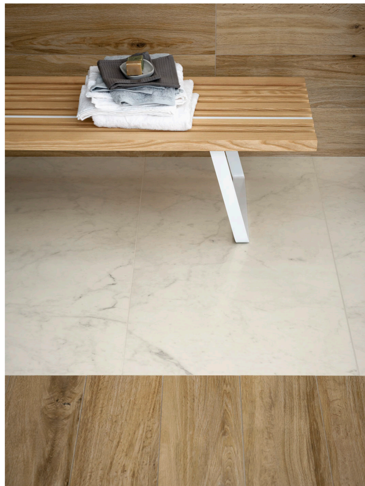
MMJF Treverktrend Rovere Miele Rt 19x150cm MMGX Almarble Altissimo Silk Rt 60x120cm