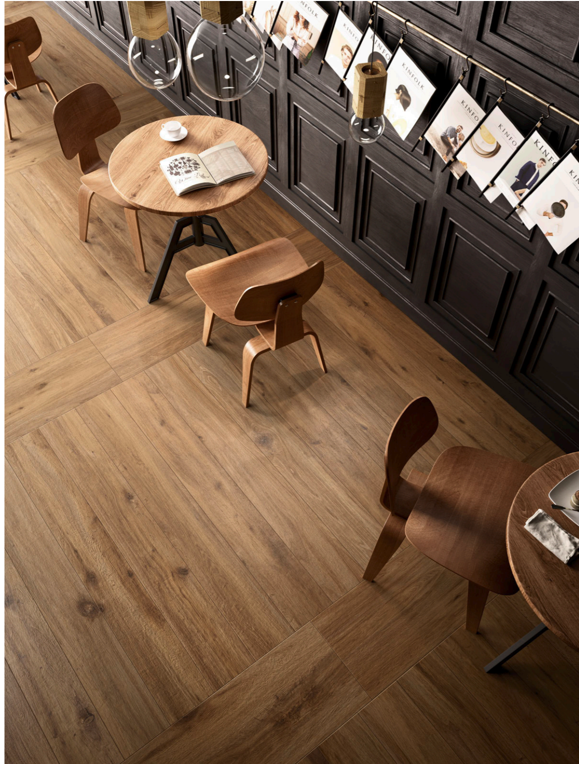
MMJG Treverktrend Rovere Scuro Rt 19x150cm MMJ3 Treverktrend Rovere Scuro Rt 37x150cm