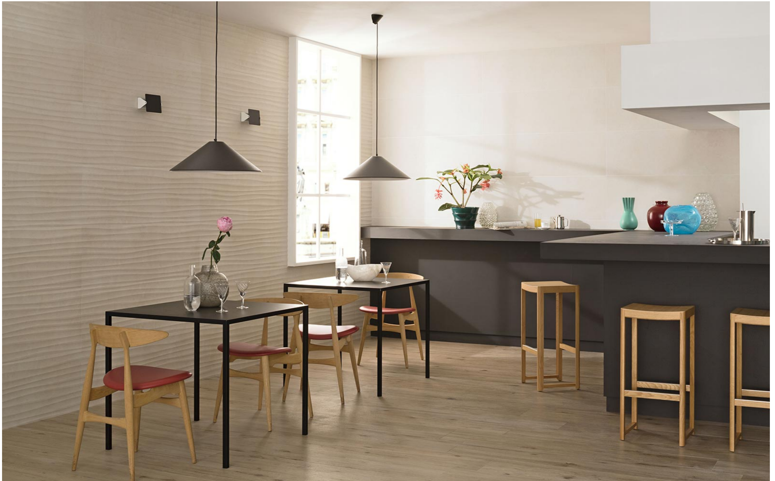
M013 400X1.2 Stone_Art Ivory Str Mo 40x120cm M00Y Stone_Art Ivory Rt 40x120cm