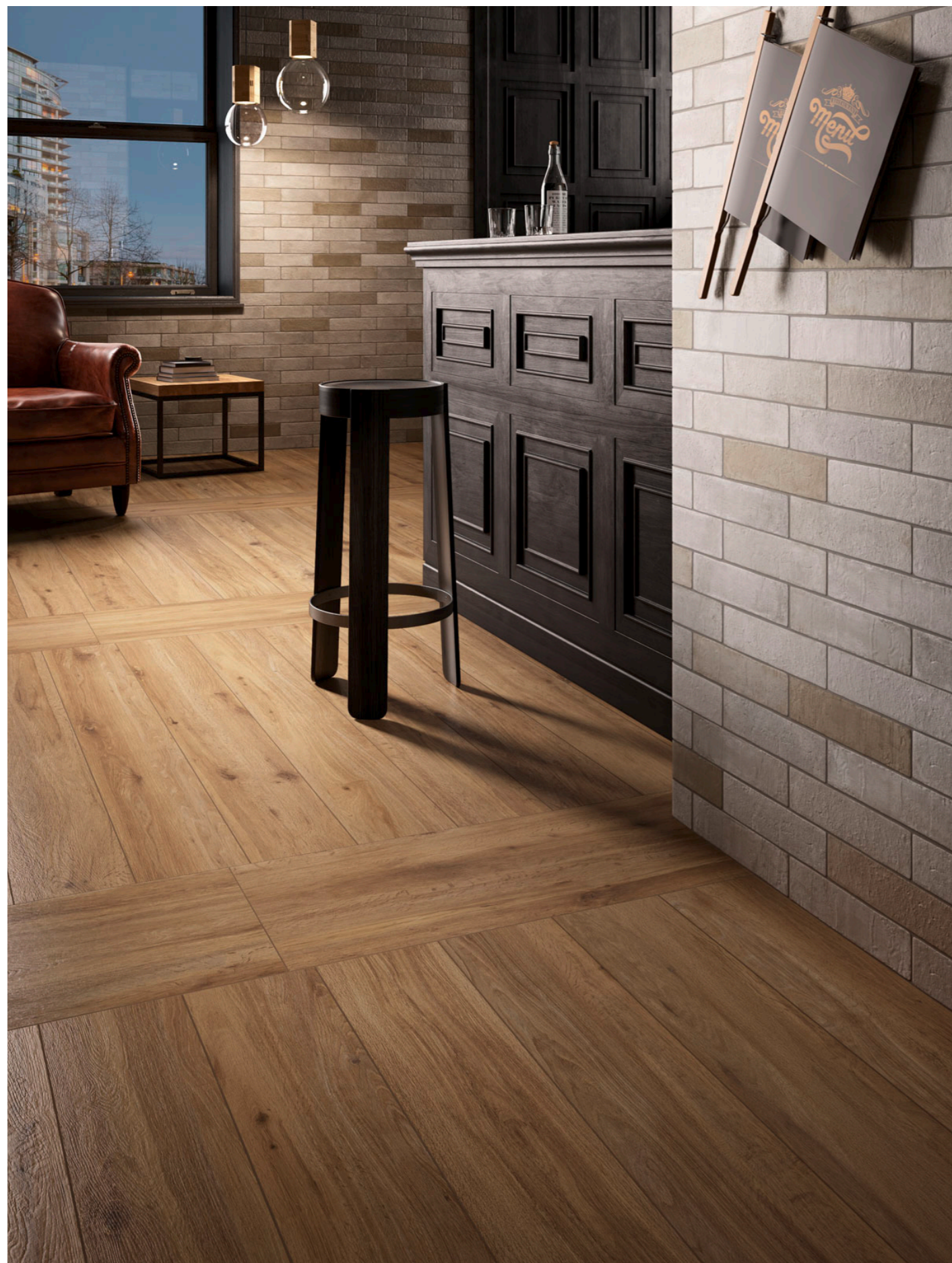
MMKY Terramix Beige 7x28cm MMJG Treverktrend Rovere Scuro Rt 19x150cm MMJ3 Treverktrend Rovere Scuro Rt 37x150cm