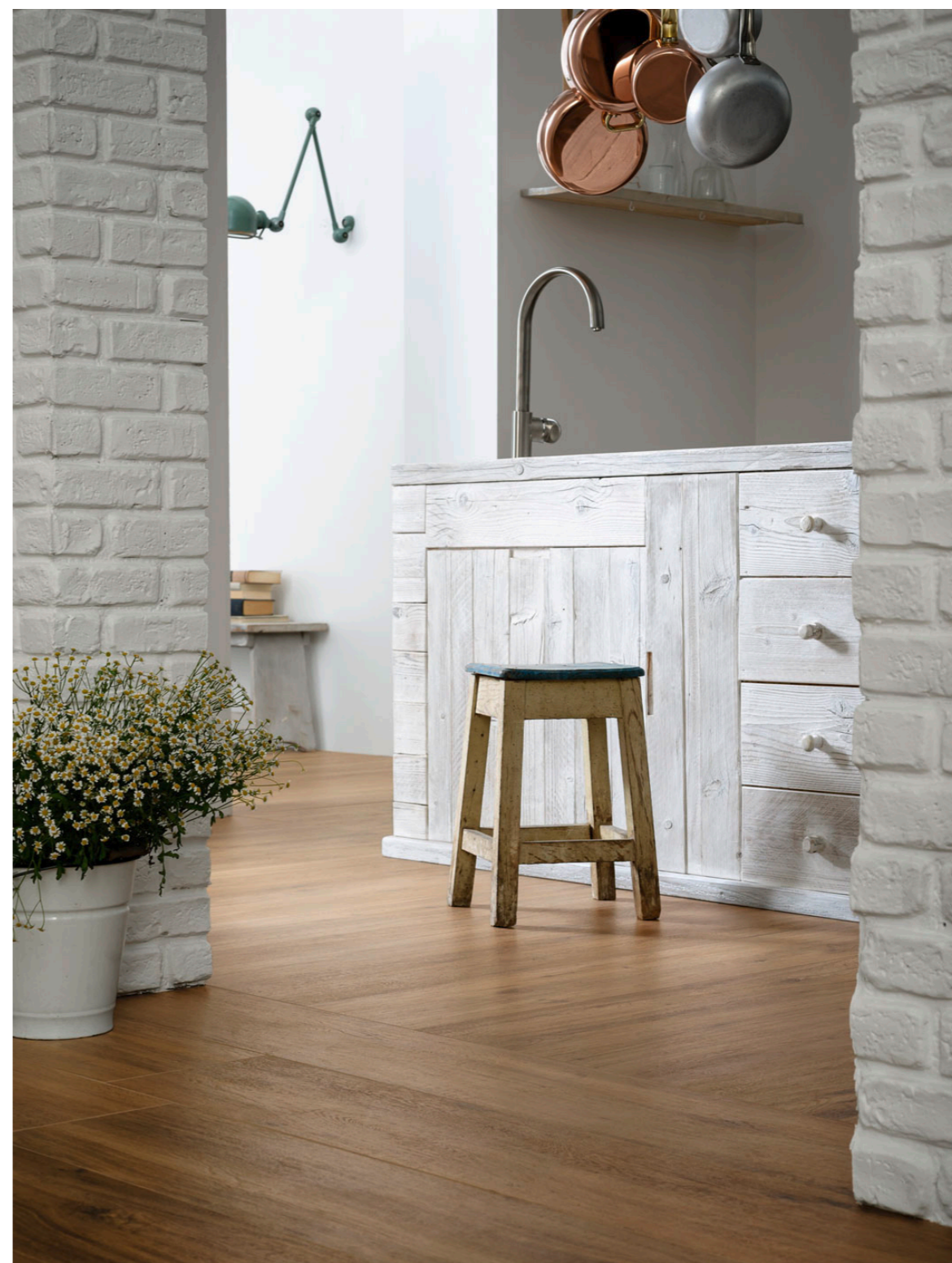
MMJ7 Treverktrend Rovere Scuro Rt 25x150cm