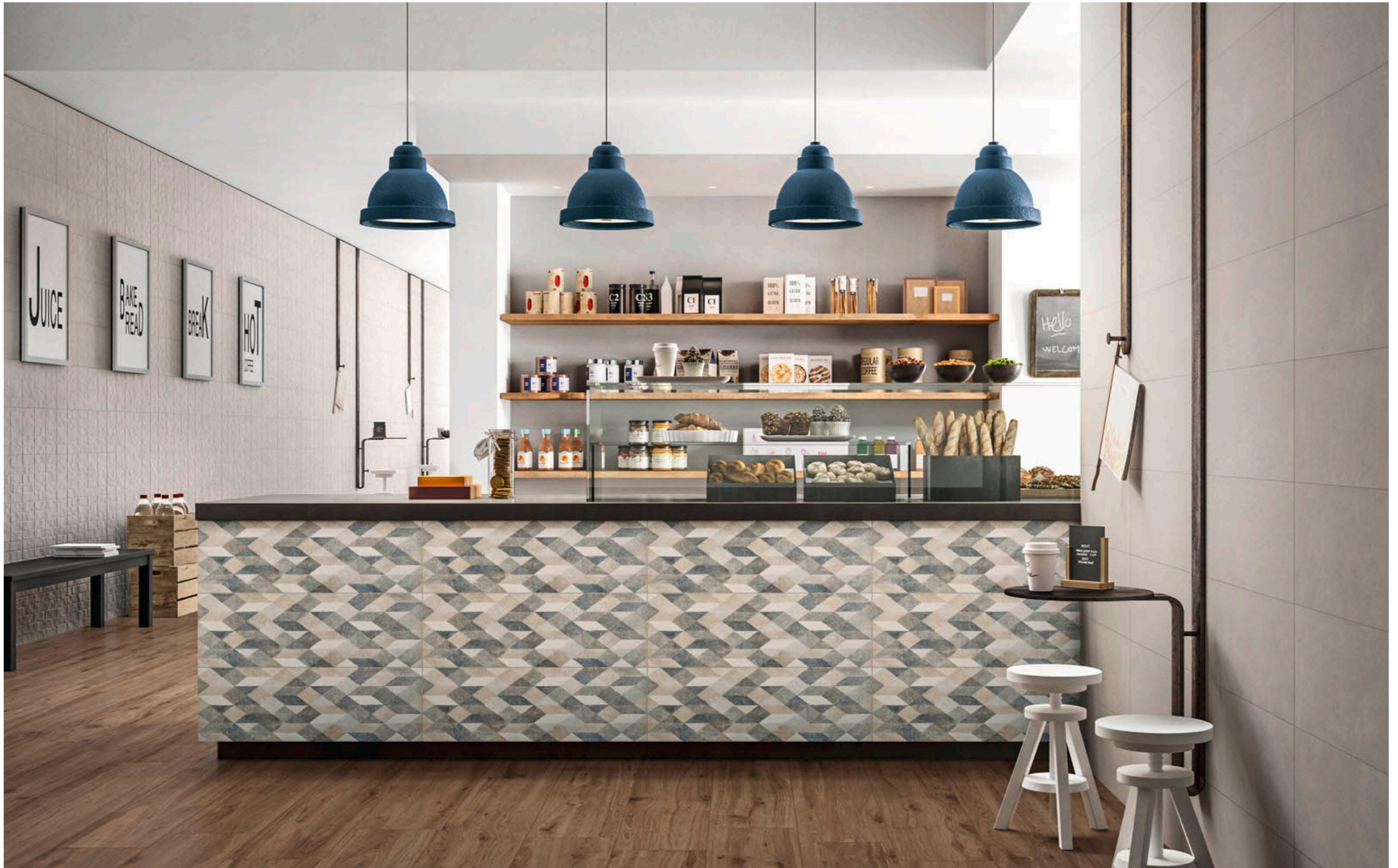
M02L Chalk Struttura Brick Gr 25x76cm M02H Chalk Grey 25x76cm