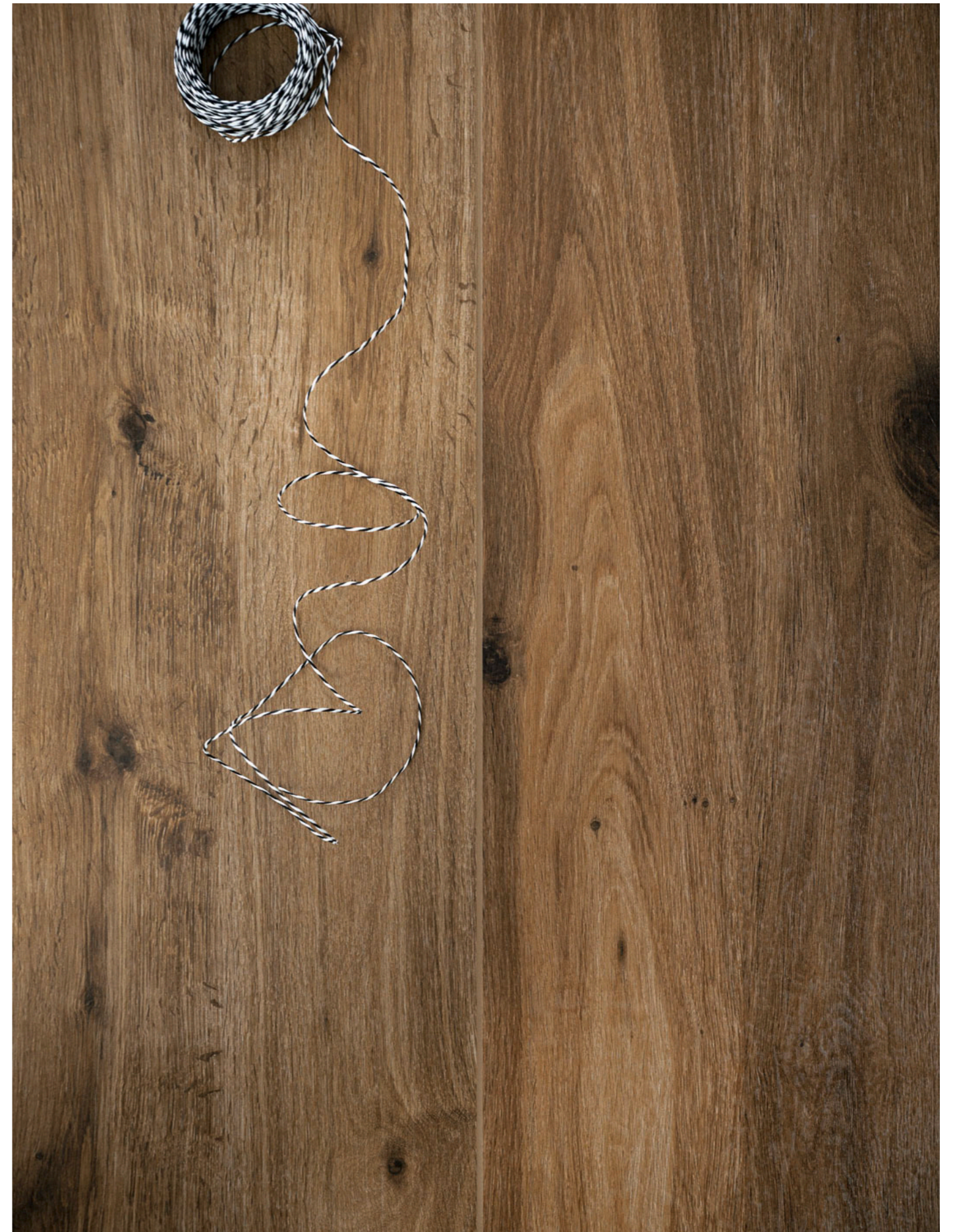
MMJ7 Treverktrend Rovere Scuro Rt 25x150cm