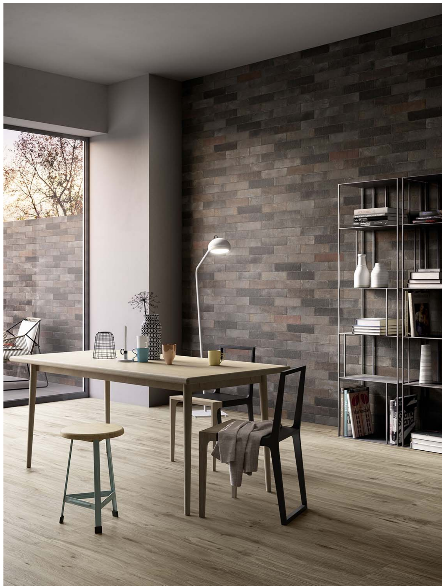
MMKW Terramix Nero 7x28cm MMJ4 Treverktrend Rovere Tortora Rt 37x150cm MLK1 Block Silver Strutturato 30x60cm