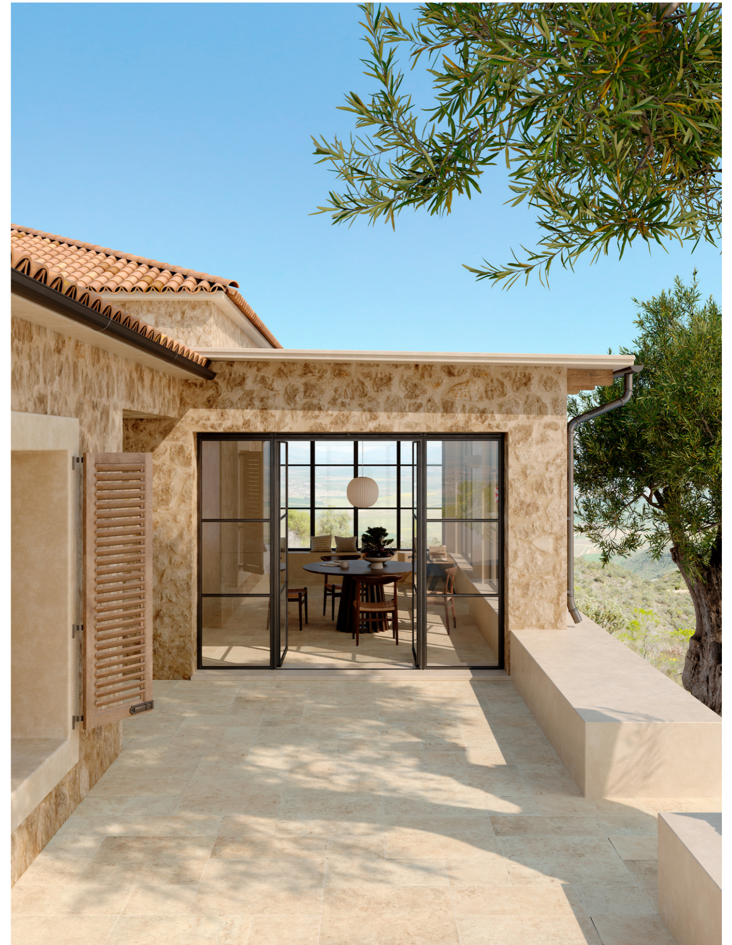
MAY4 Uniche Ostuni Structured_Surface Rt 30x30cm MAQE Uniche Ostuni Structured_Surface Rt 30x60cm MAQ3 Uniche Ostuni Structured_Surface Rt 60x60cm