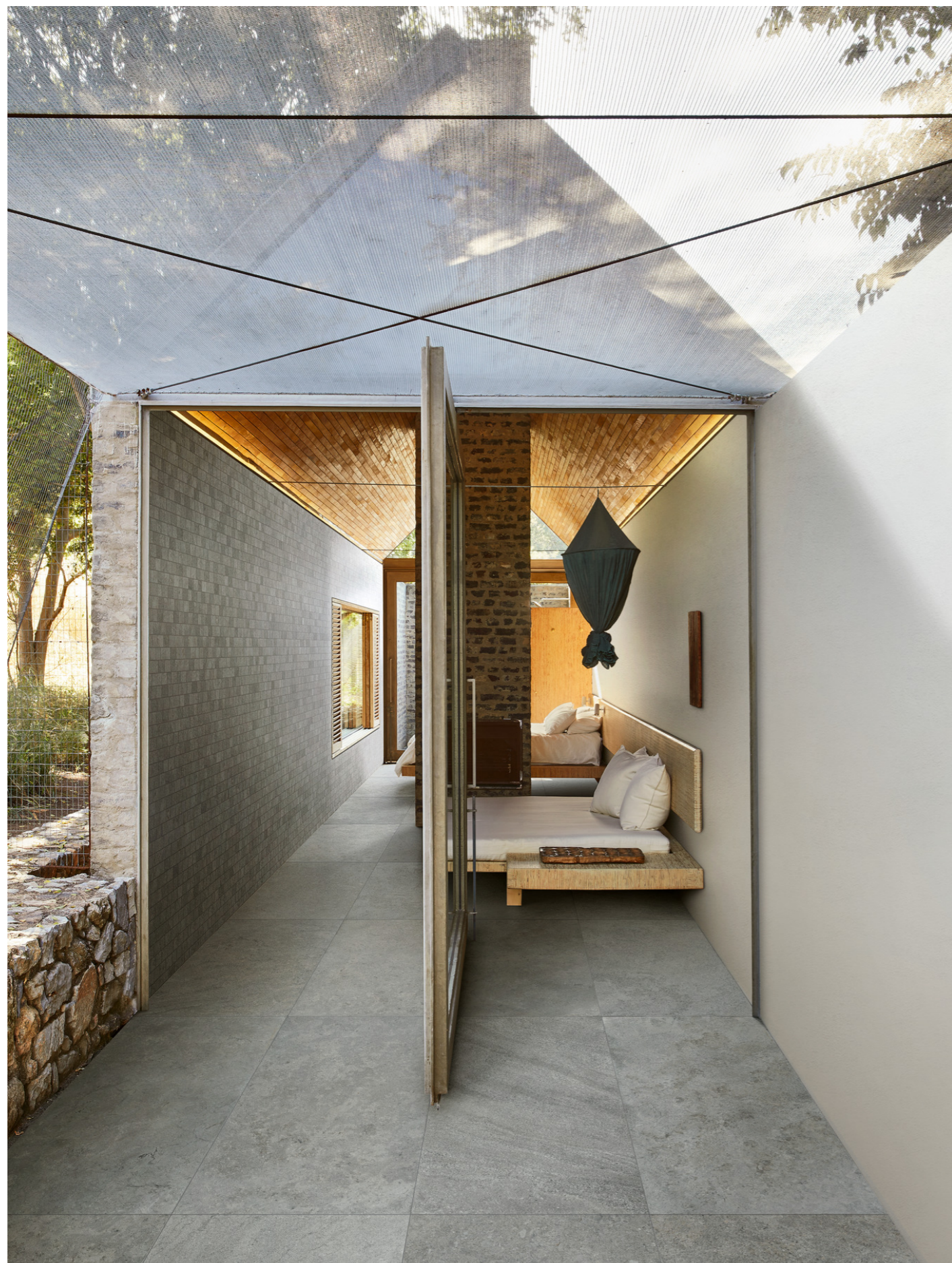
MAQX Uniche Avignone Mosaico Spaccatella 28x59cm MAHG Uniche Avignone Strutturato Rt 60x120cm MAEY Uniche Avignone Rt 60x120cm