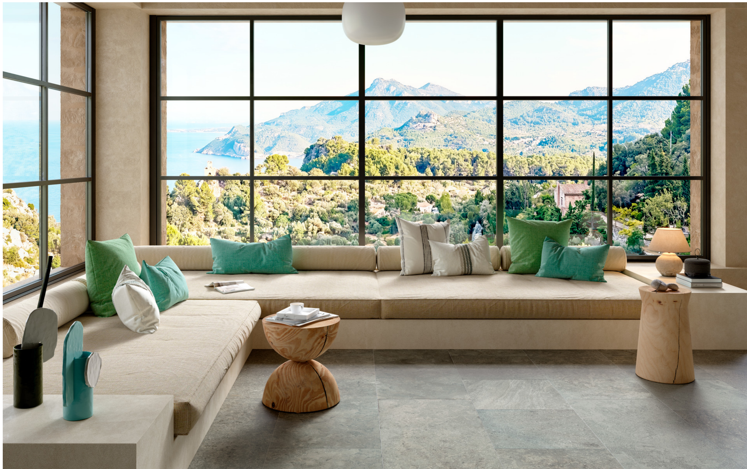
MAPZ Uniche Avignone Stepwise Rt 60x60cm MAEY Uniche Avignone Rt 60x120cm