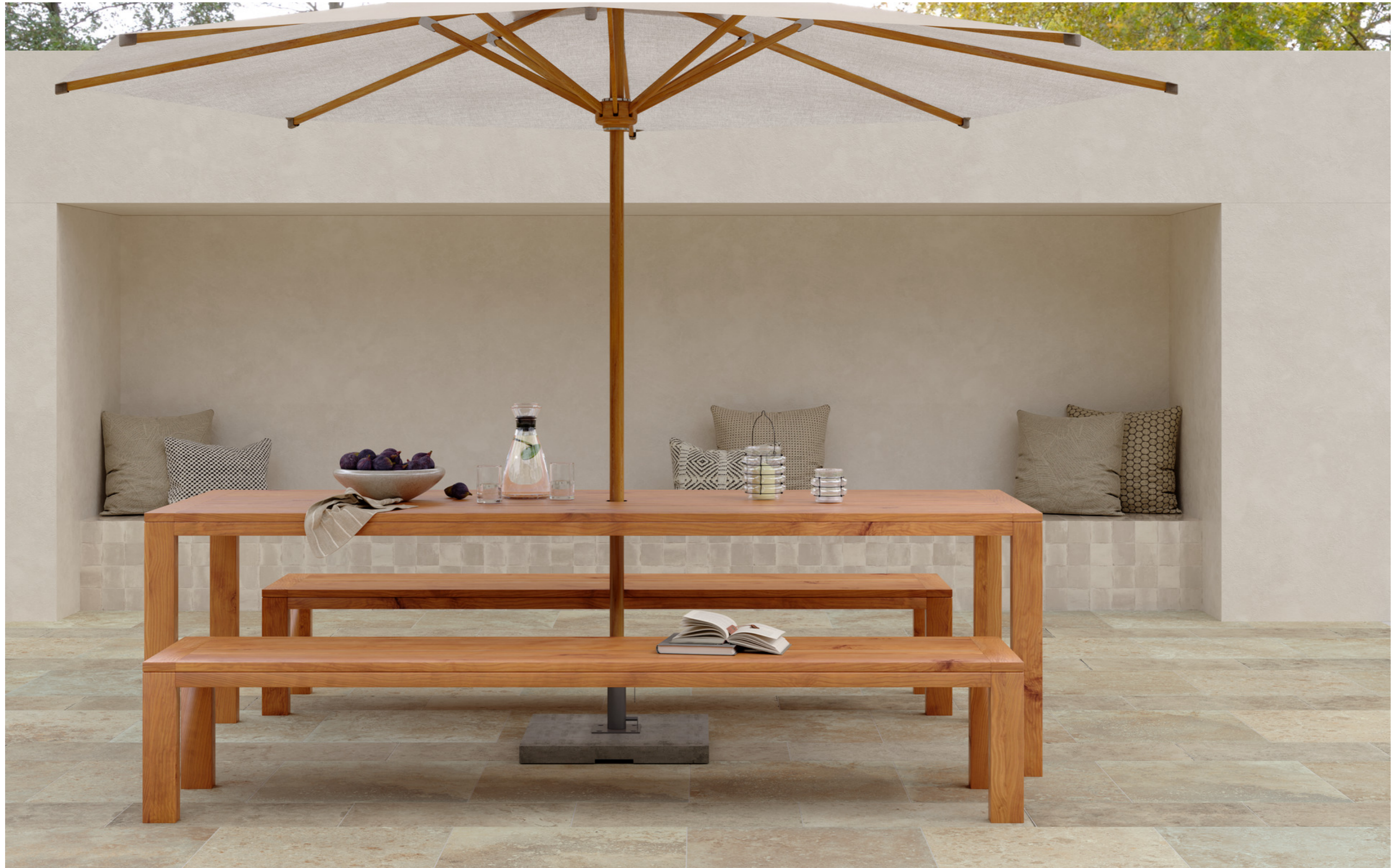
MAQD Uniche Cadiz Structured_Surface Rt 30x60cm MAQ2 Uniche Cadiz Structured_Surface Rt 60x60cm