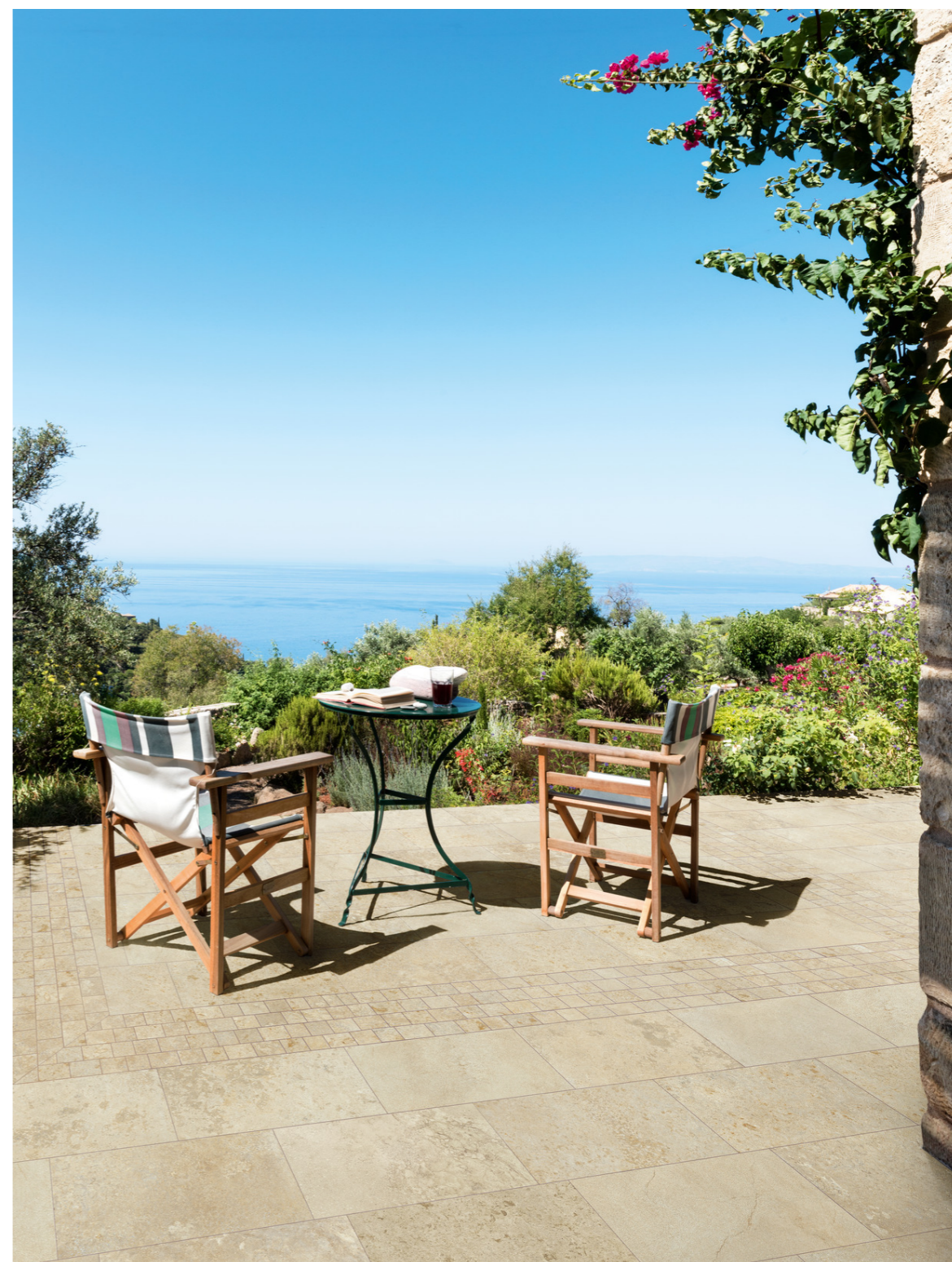
MAR1 Uniche Arles Mosaico Spaccatella Str 28x59cm MAQC Uniche Arles Structured_Surface Rt 30x60cm