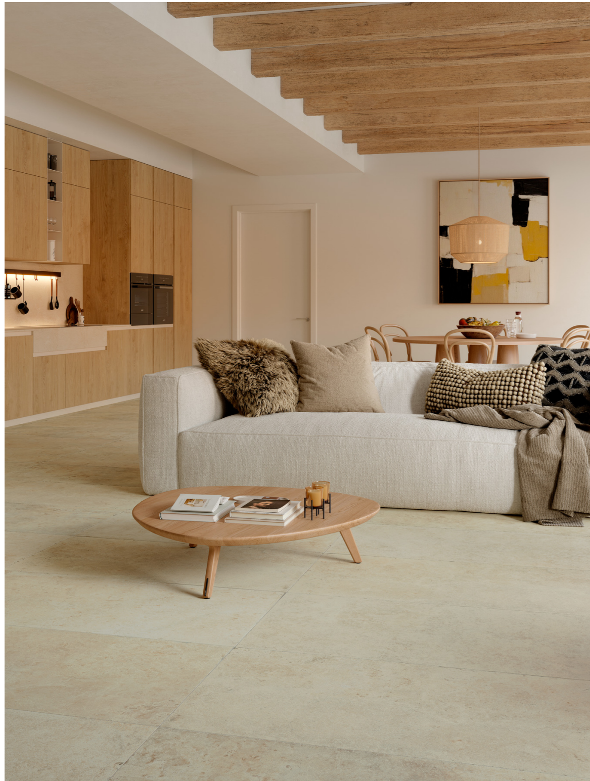
MAZL Uniche Ostuni Velvet Rt 60x120cm