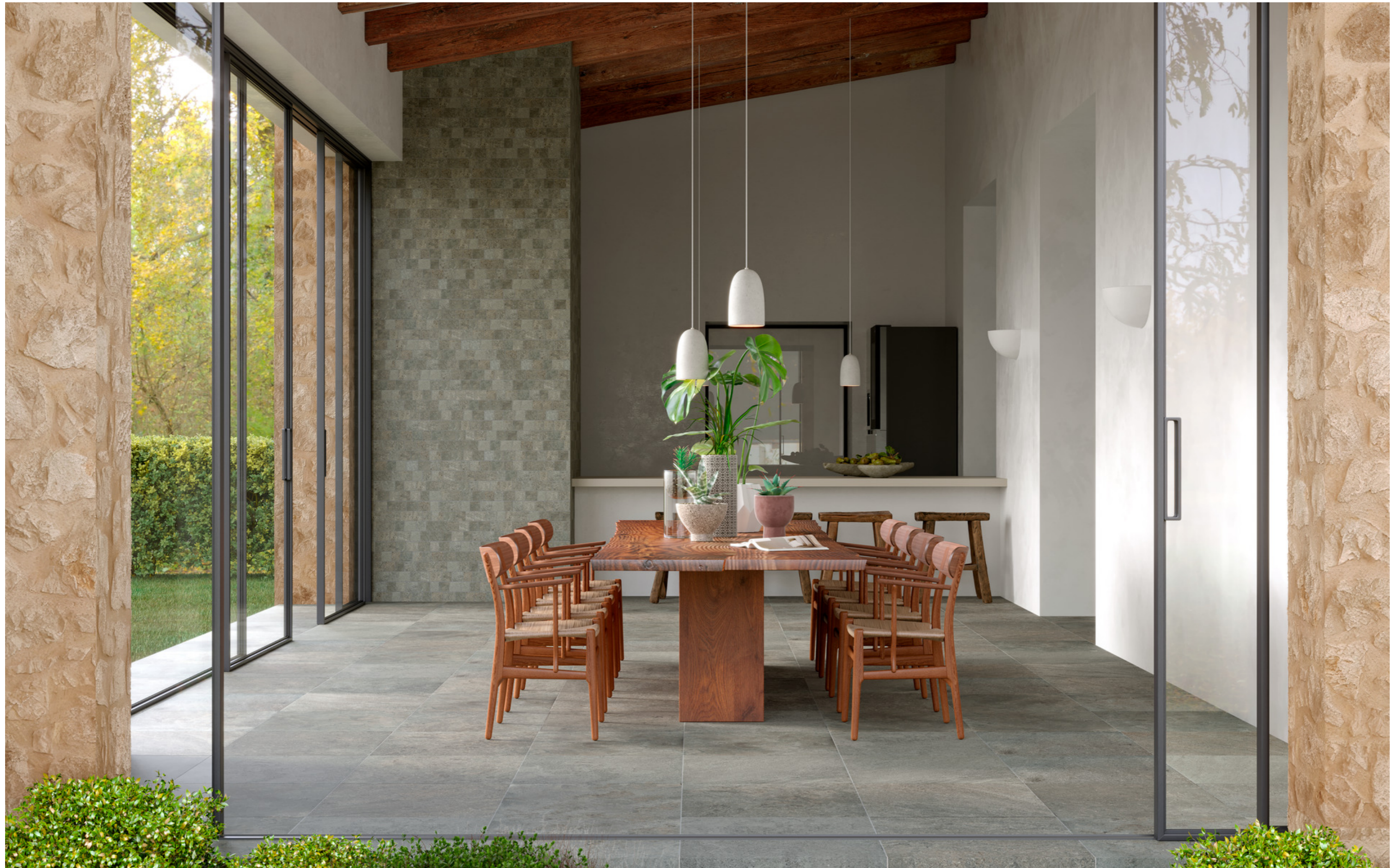
MAQZ Uniche Ostuni Mosaico Spaccatella Str 28x59cm MAPZ Uniche Avignone Stepwise Rt 60x60cm