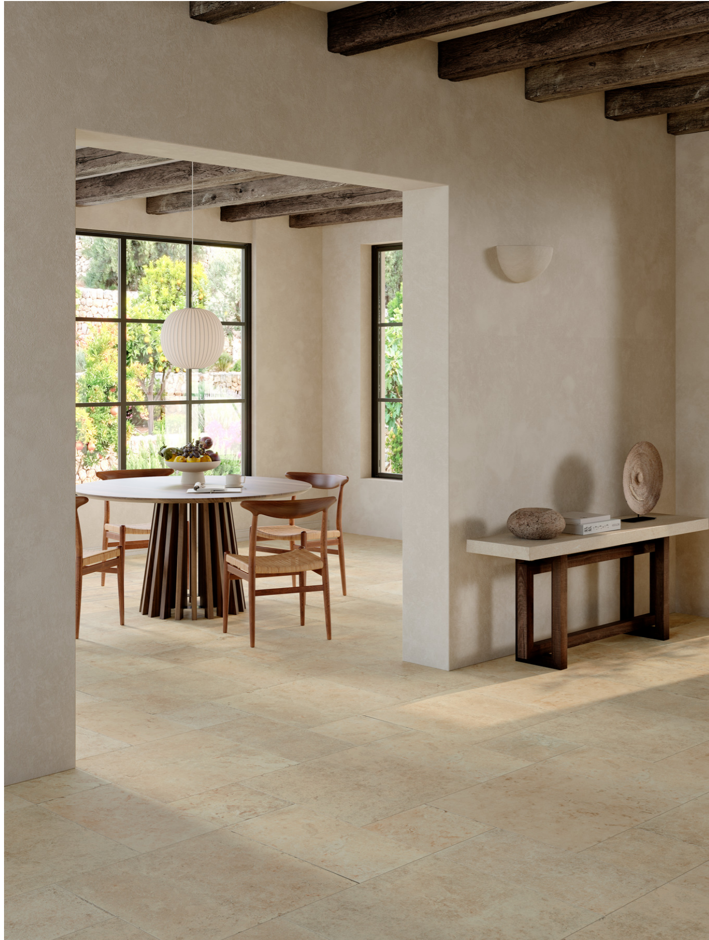
MAVD Uniche Ostuni Stepwise Rt 30x30cm MAQ8 Uniche Ostuni Stepwise Rt 30x60cm MAPY Uniche Ostuni Stepwise Rt 60x60cm