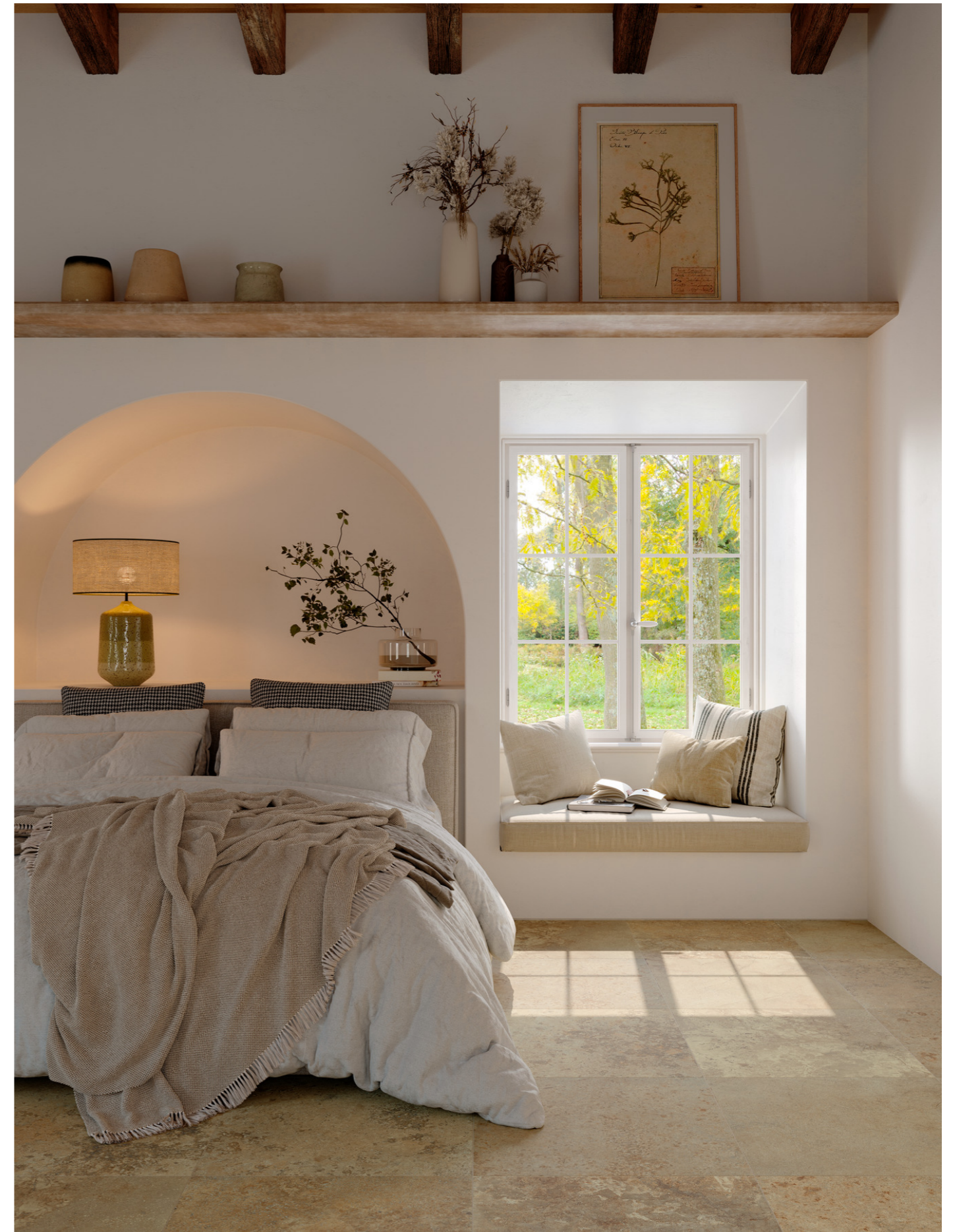
MAPW Uniche Arles Stepwise Rt 60x60cm