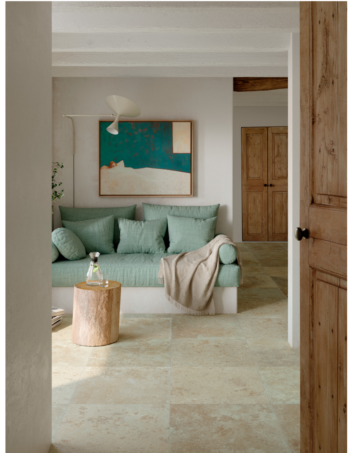
MAPX Uniche Cadiz Stepwise Rt 60x60cm