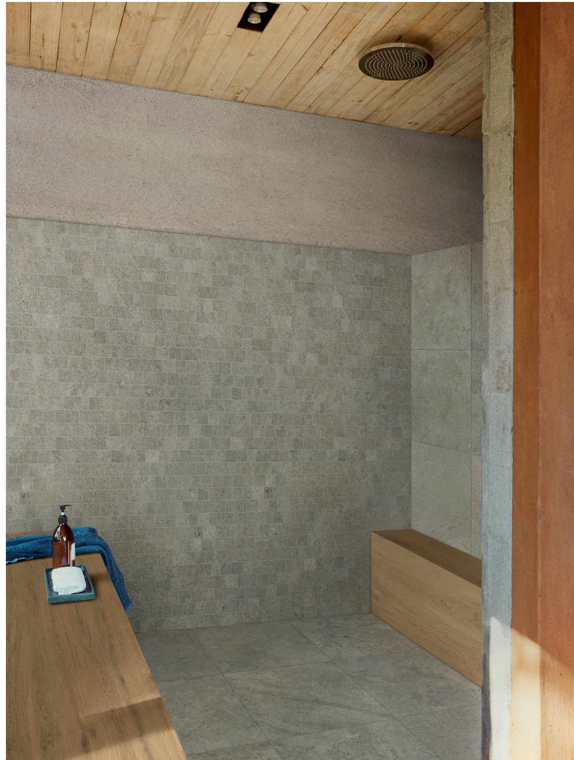
MAR2 Uniche Avignone Mosaico Spaccatella Str 28x59cm MAQ4 Uniche Avignone Structured_Surface Rt 60x60cm