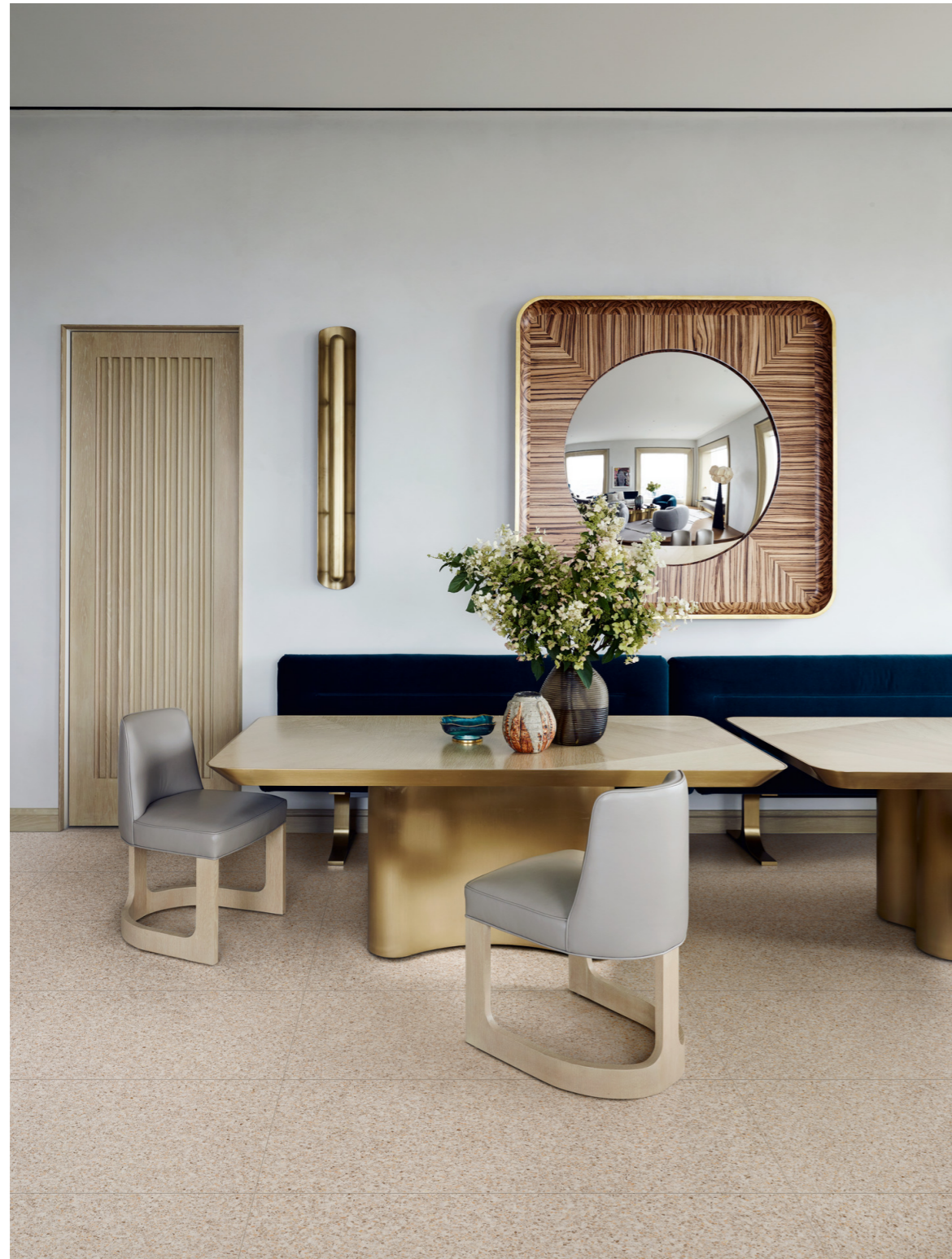
MNOW Frammento Micro Cotto R10 Rt 60x120cm