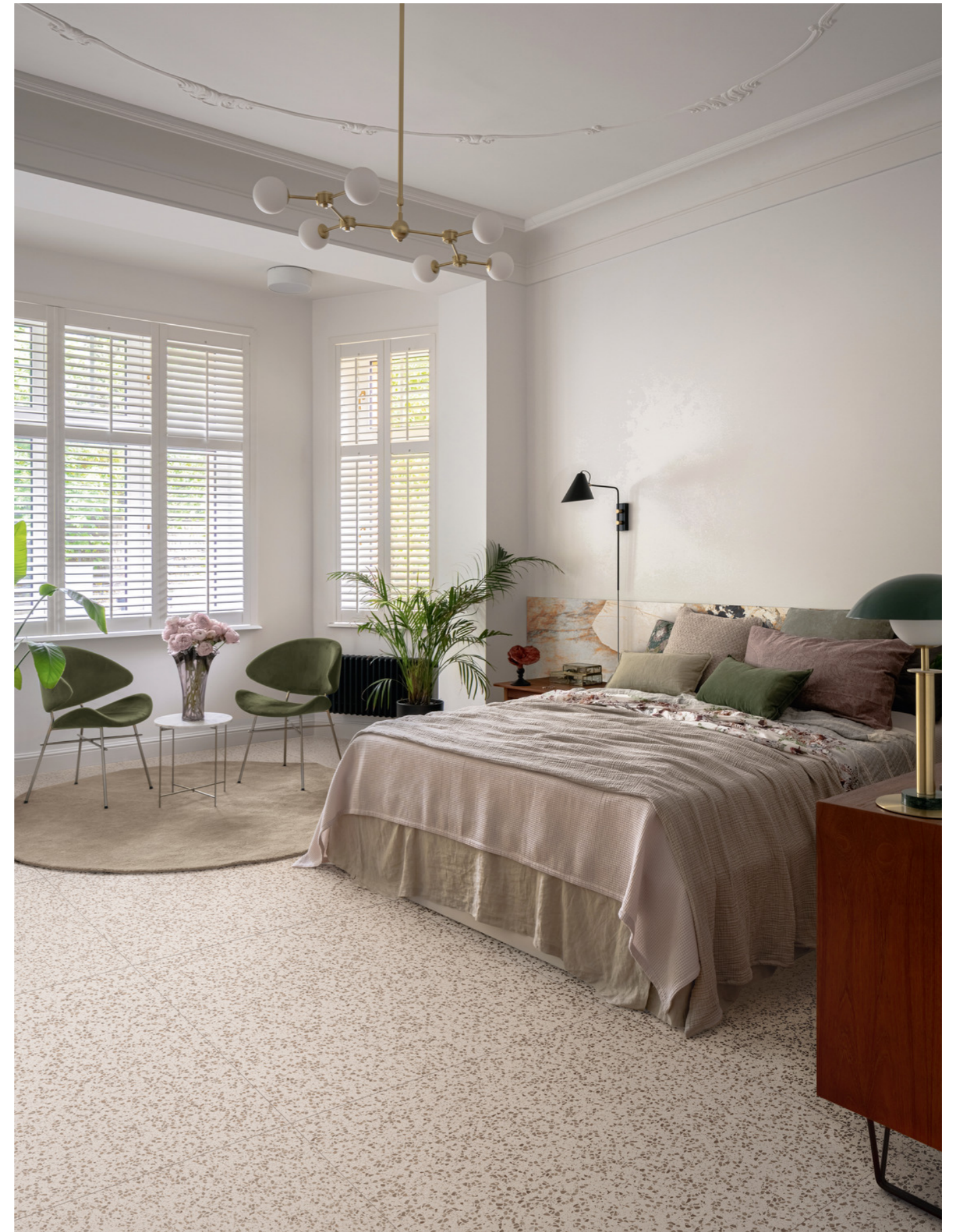
MMYR Frammento Macro Cotto R10 Rt 120x120cm MGFS Grande Marble Look Patagonia Lux Rt 6Mm 160x320cm