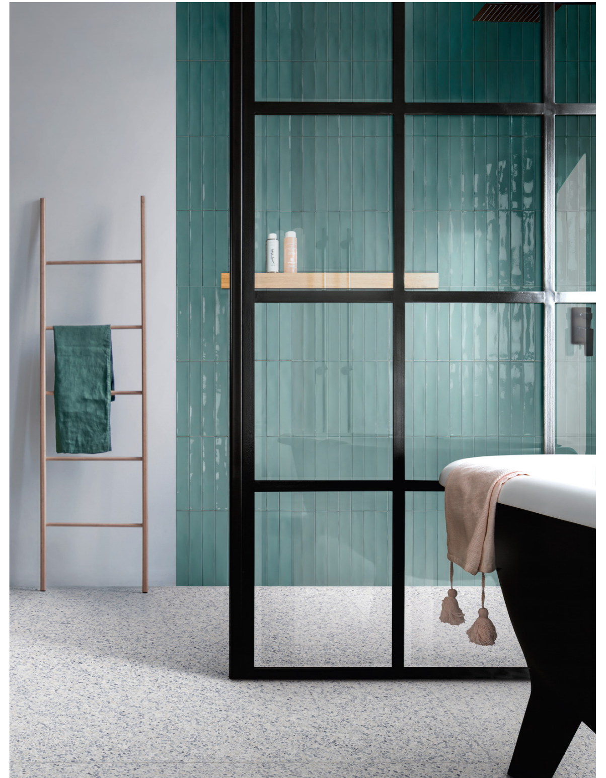
MNOX Frammento Micro Azzurro R10 Rt 60x120cm MFLS Luz Azzurro Polvere Lux 5x30cm