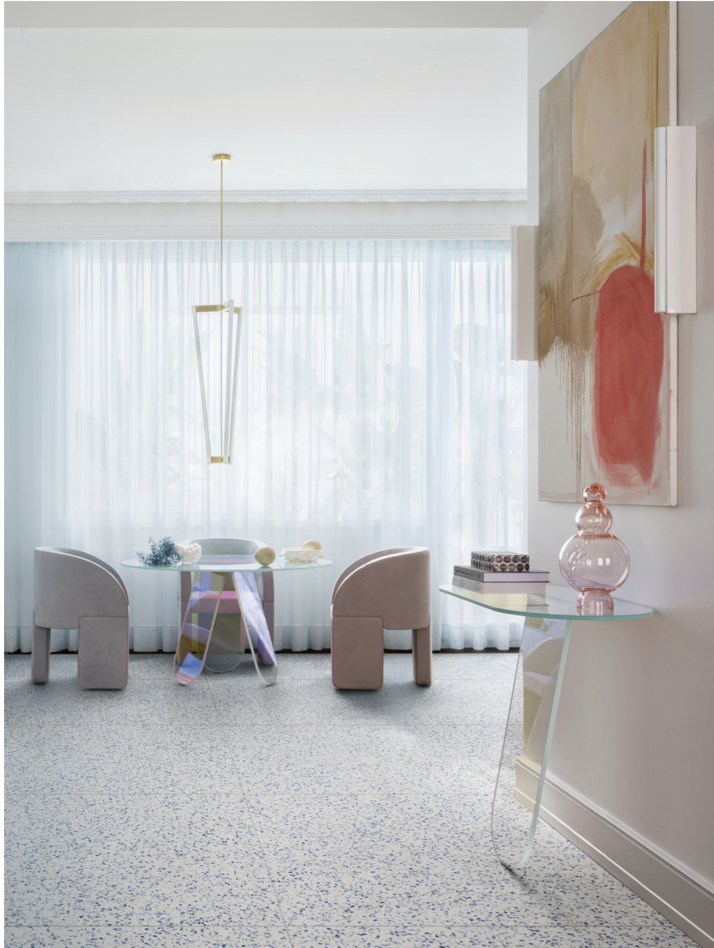
MMZY Frammento Macro Azzurro R10 Rt 120x120cm