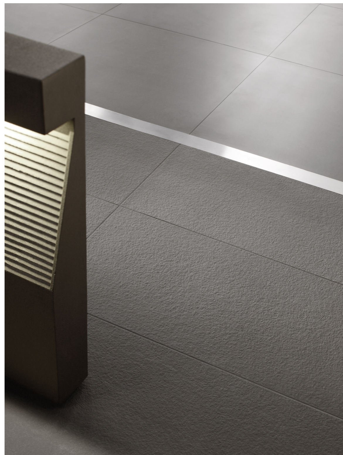
M831 Neutro Grigio Scuro Bocc. 30X60 30x60cm M827 Neutro Grigio Scuro 60X60 60x60cm