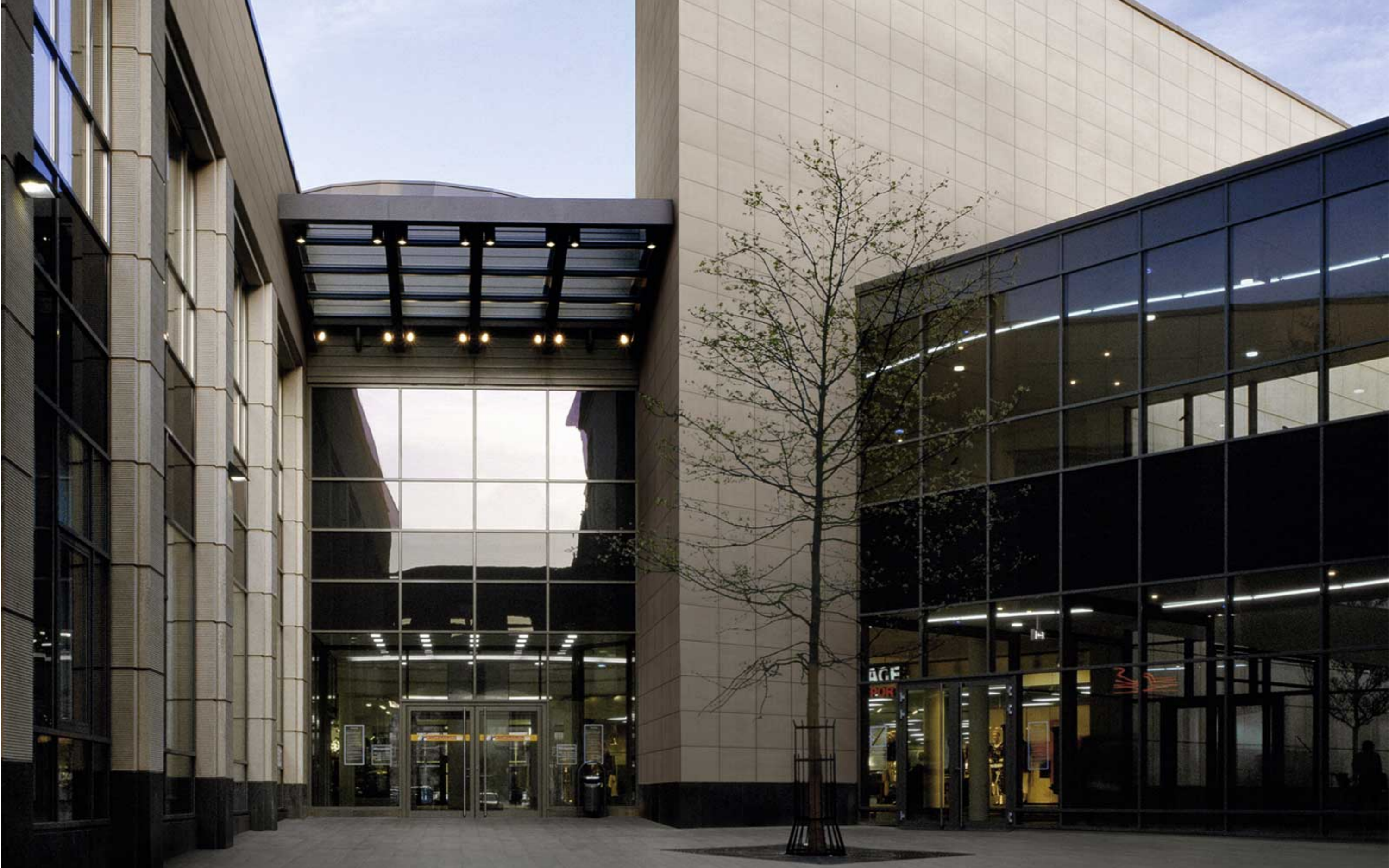
M831 Neutro Grigio Scuro Bocc. 30X60 30x60cm M7RA Neutro Sabbia 60X60 60x60cm