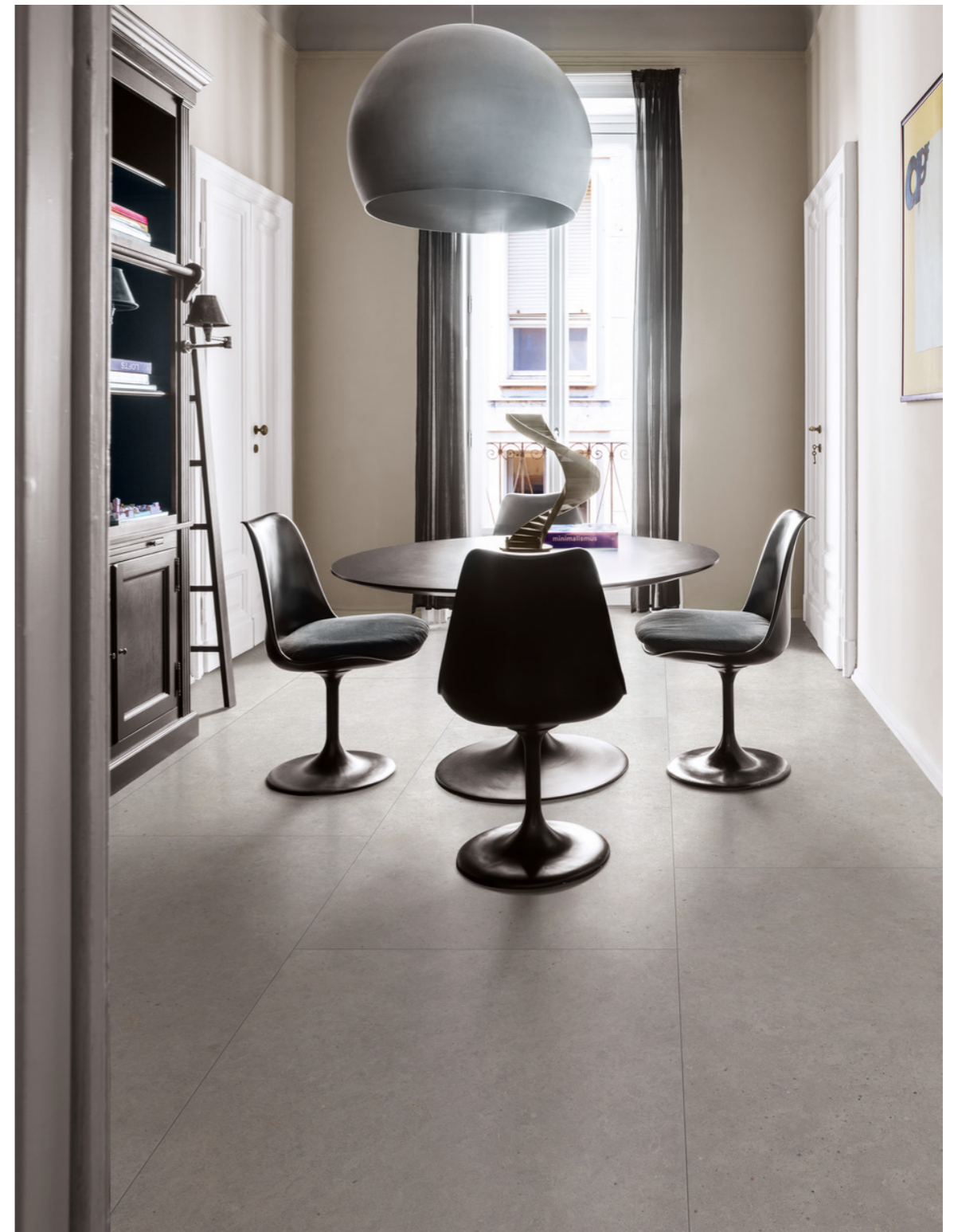
M6AX Moon White Rt 90x180cm