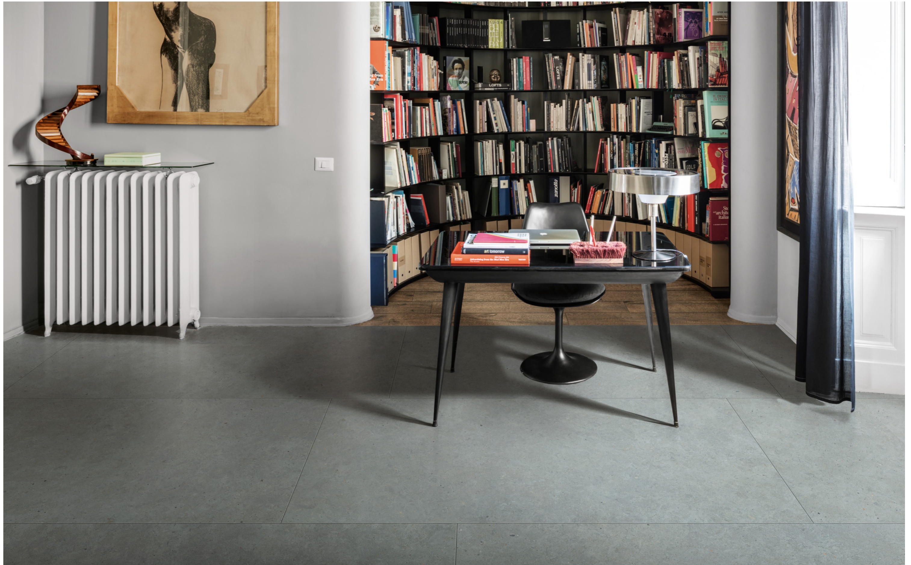
M7C0 Vero Rovere Rt 20x120cm M6AS Moon Anthracite Rt 90x180cm