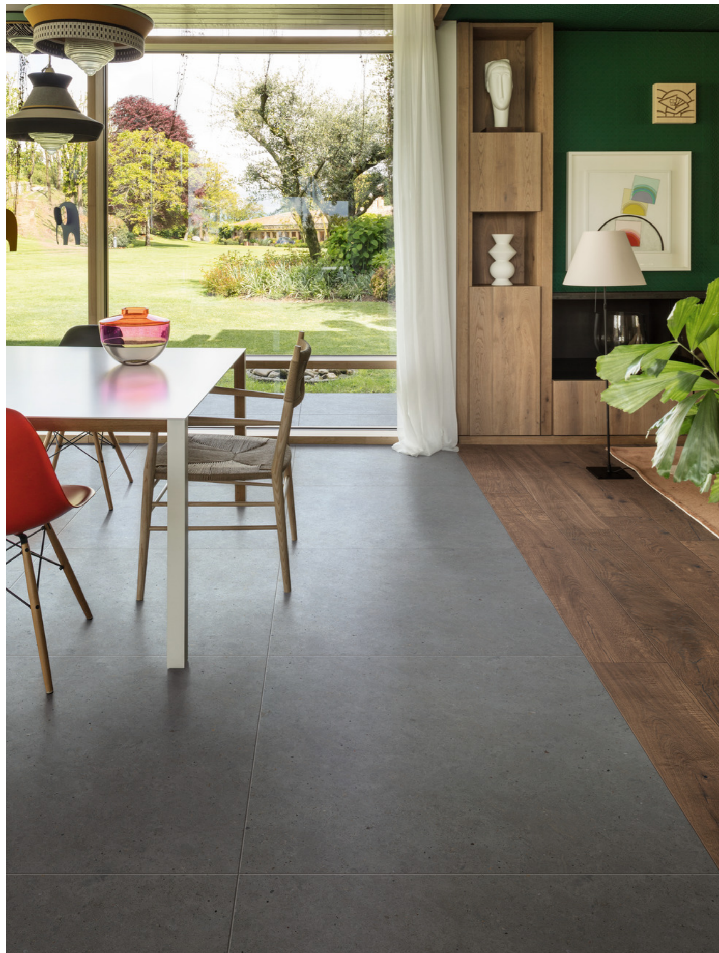
M7AW Vero Quercia Rt 22x180cm M6AZ Moon Anthracite Rt 90x90cm