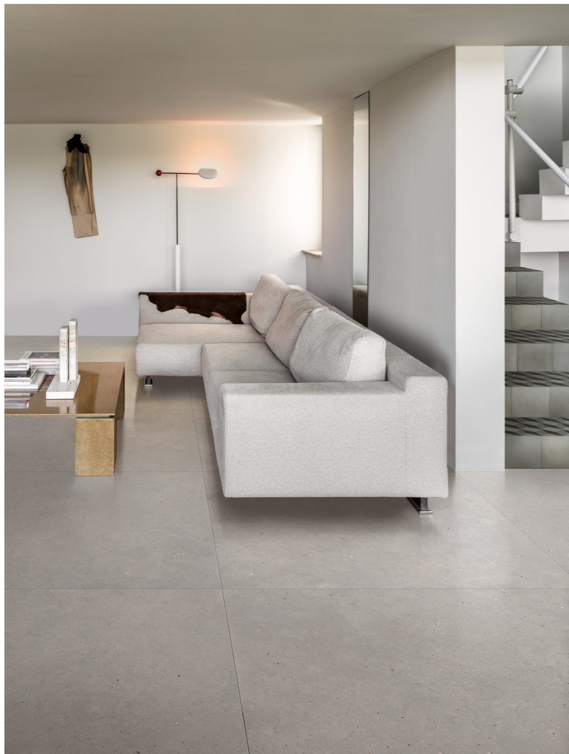
M903 Moon White Rt 120x120cm M60W D_Segni Blend Tappeto 10 20x20cm M603 D_Segni Blend Carbone 20x20cm