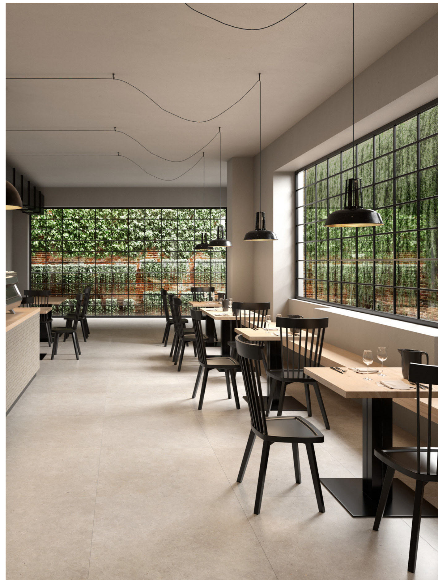
M8LJ Moon White Mosaico Spaccatella 30x30cm M6DS Moon White Rt 90x90cm