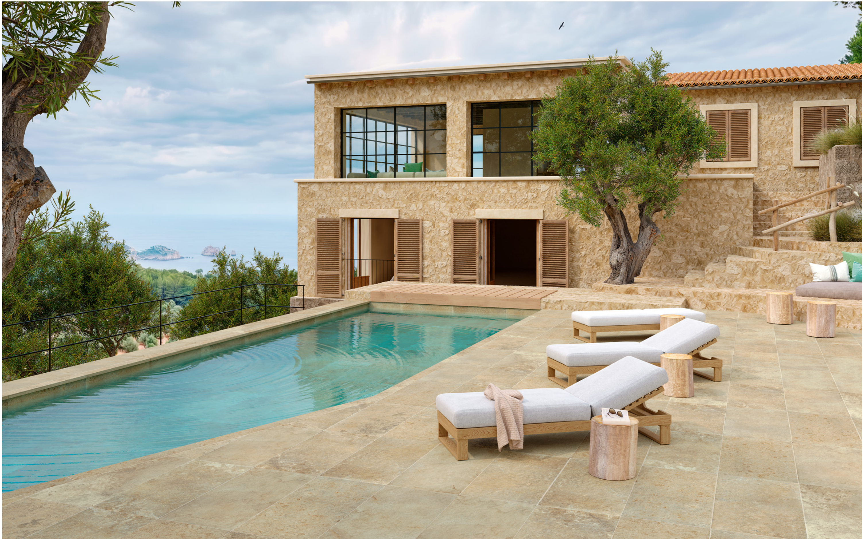
MASS Uniche20 Arles Str Elemento Ad L Rt 15x120cm MAR6 Uniche20 Arles Rt 60x120cm